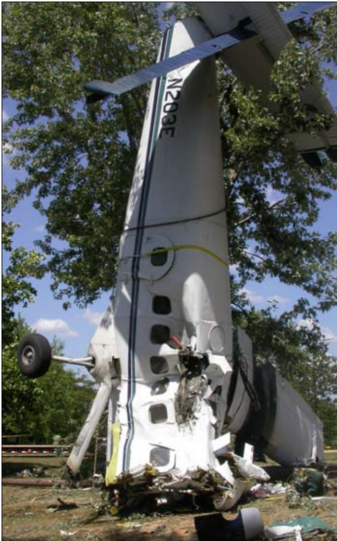
Figure 4. Photograph of the crush damage on the fuselage (right wing removed from wreckage).

Only two of the seven parachutists survived the accident even though the airplane was equipped with parachutists' restraints and the cabin area in which all the parachutists