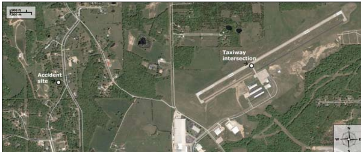
Figure 2. Aerial map of UUV showing runway 24, the intersecting taxiway, and the accident site.

Witnesses reported that the airplane lost some altitude, regained it, and then continued to fly low above the treetops before turning to the right and disappearing from their view behind the treeline. Another witness in the backyard of a residence northwest of the airport reported that she saw the airplane flying straight and level but very low over the trees before it dived nose first to the ground. She and her father called 911, and she said that local emergency medical service personnel arrived within minutes. The airplane impacted trees and terrain and came to rest vertically, nose down against a tree behind a residence about 1/2 mile northwest of the end of runway 24. (An aerial map of the runway and accident site is shown in figure 2.)