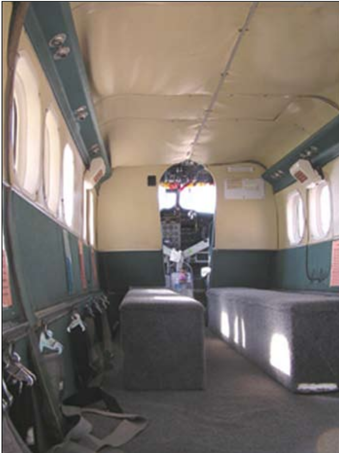
Figure 3. Pre-accident photograph of accident airplane interior showing both foam block benches and some left-side restraints (view from left-side cargo door, looking forward); photograph provided by a relative of the pilot.

wreckage; instead, two solid foam blocks, each measuring about 5 to 6 feet long and 15 to 18 inches tall and wide, were in the airplane. Each solid foam block served as a seating bench that extended aft from the forward cabin, parallel to each exterior cabin wall. The position of the two foam block benches allowed space for a center aisle and space between each bench and sidewall. (See figure 3 above.)