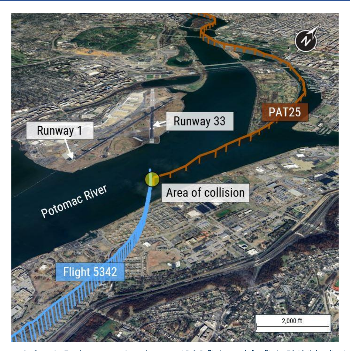
Figure 1. Google Earth image with preliminary ADS-B flight track for flight 5342 (blue line) and preliminary radar data for PAT25 (orange line).

DCA is equipped with three runways: runway 1/19, runway 15/33, and runway 4/22.³ In general, when DCA is conducting north operations (as was the case when the collision occurred), traffic lands and departs on runway 1 with intermittent arrivals to runway 33 based on traffic demands and separation requirements. Conducting northbound operations with simultaneous operations to runways 1 and 33 is a routine ATC procedure in compliance with FAA Order 7110.65BB. Use of