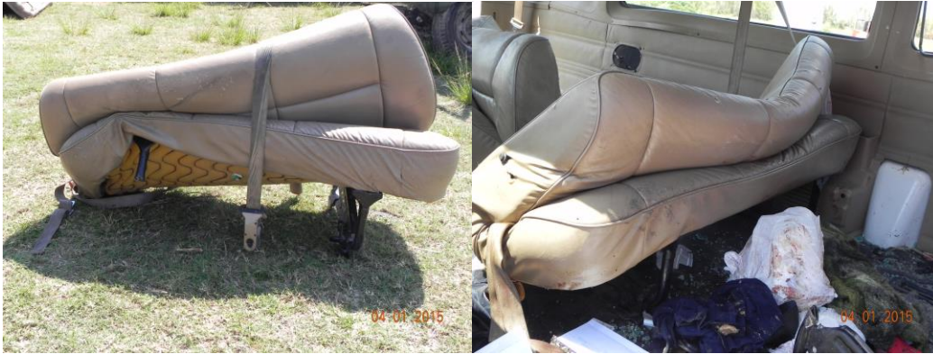
Figure 5. The bench seats from rows 1 and 2 of the Dodge 15-passenger van.

The front air bags deployed in the crash.