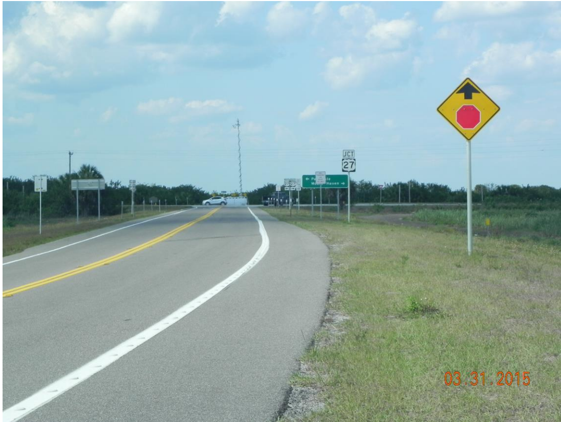
Figure 2. Advance warning sign on the approach to the intersection of SR-78 West and US-27.