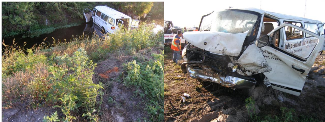
Figure 4. (a) Left—postcrash view of Dodge 15-passenger van at final rest in canal. NOTE: Orange paint on ground indicates area of vault. (Source: Florida Highway Patrol) (b) Right—postcrash view of front end deformation to Dodge 15-passenger van. (Source: Florida Highway Patrol)

The Florida Highway Patrol (FHP) conducted a postcrash examination of the vehicle. The van's tires revealed no precrash defects; only crash-related damage was noted. The right front tire and both rear tires could be rotated freely; the left front tire was impinged by crash-related damage and could not be rotated. The FHP depressed the brake pedal as the tires were rotated; the brakes engaged and negated rotation of the tires. The master cylinder and power brake booster were found to be intact. The brake fluid reservoir was found to contain sufficient fluid. Although the left front brake line was compromised during the crash, the FHP inspector was able to pinch the line to stop the leakage. There was evidence of headlight filament deformation, indicating that the headlights had been illuminated (on) during this crash. The FHP found that the rearmost bench seat (fourth row) had been set in place without being secured to the floor. The FHP found no mechanical defects that might have contributed to the cause of this crash.