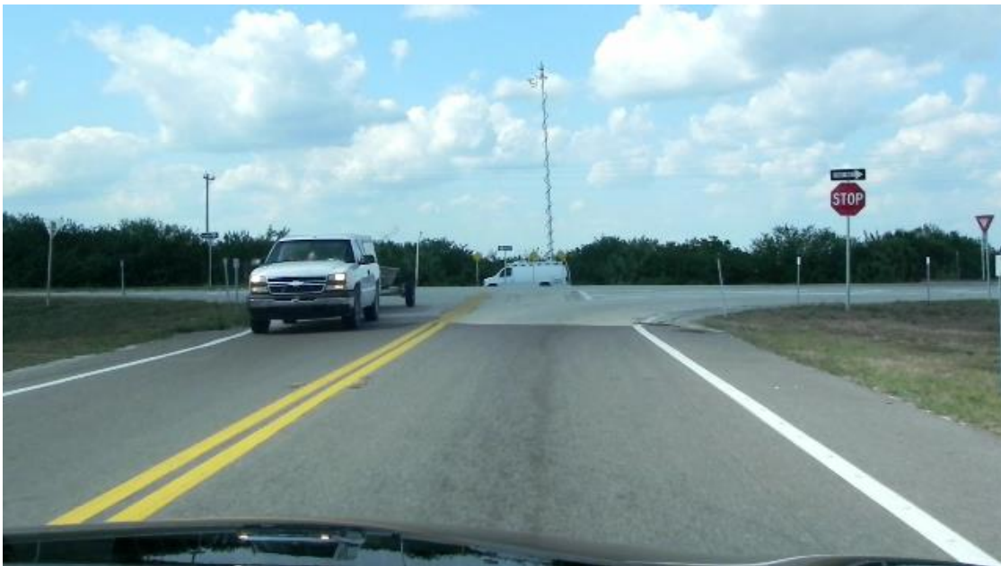
Figure 3. Stop sign at the intersection of SR-78 West and US-27.