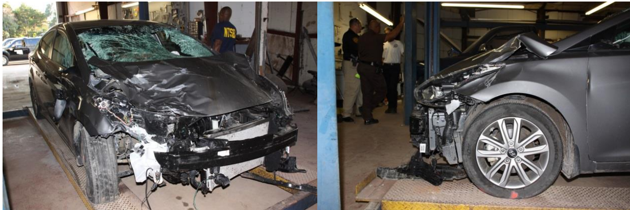
Figure 2. Postcrash views of the front (left) and driver's side front of the Hyundai (right).

The right front tire was deflated, and the right wheel was displaced aft into the fender well. The right and left front fenders were damaged, and both outside mirrors were displaced. Both sides of the car had areas of minor damage. (See figure 2 for images of damage to the Hyundai.)