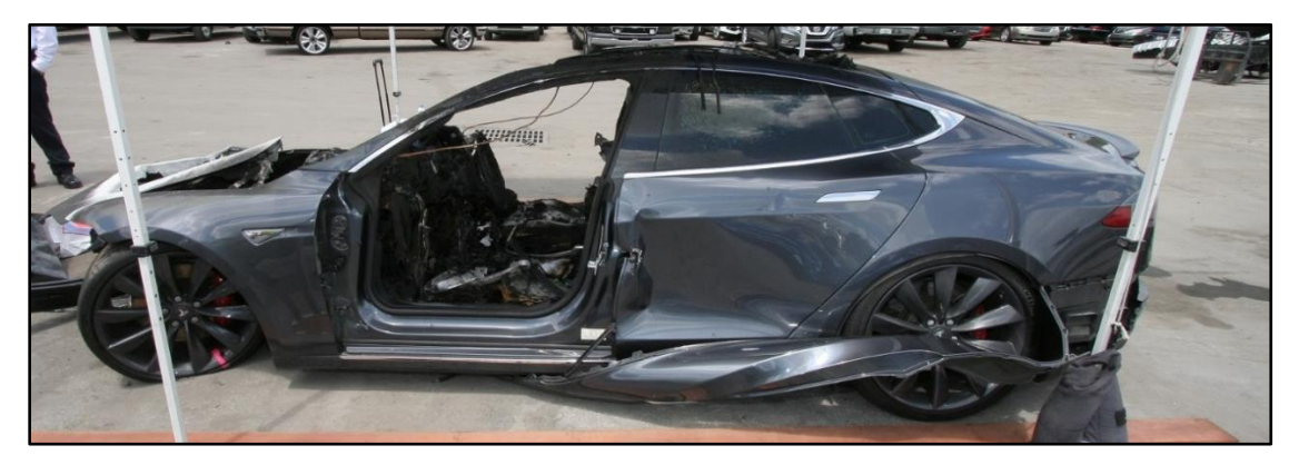
Figure 4. Left side of car showing minor-to-moderate crash damage and limited fire damage.

The left (driver) side of the car exhibited minor-to-moderate crash damage along its length. Thermal damage was minimal and limited to the left front fender, forward of the wheel (figure 4).