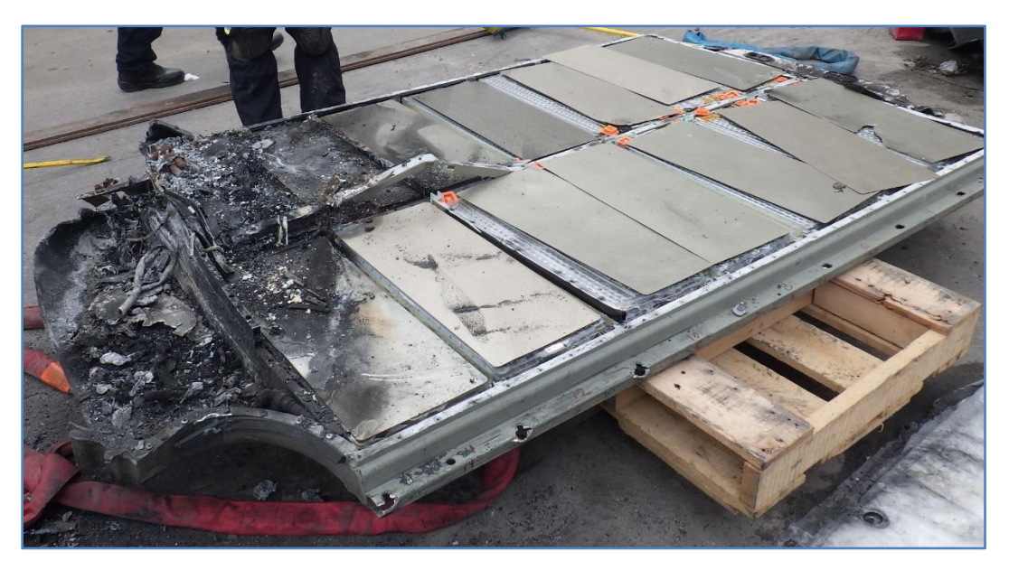
Figure 3 . Photo of battery showing fire-damaged region at front that contained modules 15 and 16, loose individual cells (rust-colored), vertically stacked cells below loosened covers, and orange insulation caps covering high-voltage terminals.

The vehicle's 400-VDC, 85-kWh lithium-ion traction battery was located under the floor of the car and spanned an area from the front tires rearward. The battery was divided into 16 modules (numbered from rear to front), plus a compartment for the battery management system. Each module contained individual battery cells stacked vertically. Figure 3 shows the fire-damaged battery. Modules 15 and 16, at the front of the car, were the most severely burned.