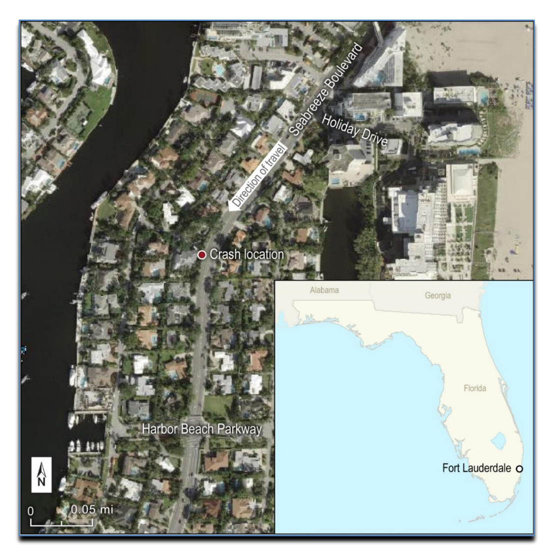
Figure 1 . Satellite view of crash location showing direction of travel, with inset map of Florida showing Fort Lauderdale.

The car reentered the road, mounted the curb on the east side of Seabreeze Boulevard, struck a metal light pole, rotated, and came to rest in the driveway of an adjacent residence. The car was engulfed in fire. Both the driver and the front passenger died in the crash. The rear passenger was ejected during the crash and was transported to a local hospital with serious injuries. At the time of the crash, it was daylight, the weather was clear, and the road was dry.