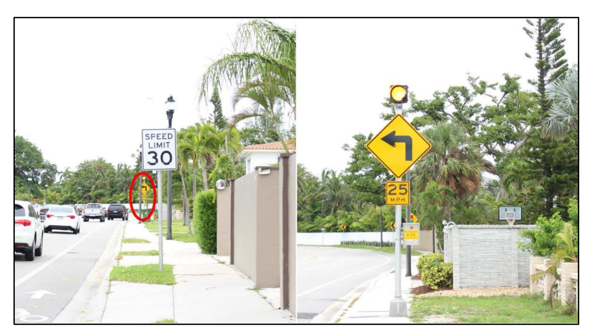
Figure 2 . (Left) southbound Seabreeze Boulevard with speed limit sign and turn-warning sign (circled in red); and (right) closeup of approach to curve with turn-warning sign, flashing beacon, and advisory speed sign.