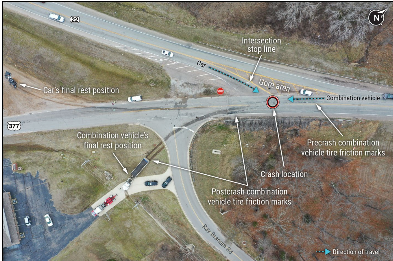
Figure 2. Aerial view of crash scene with final rest positions of car and combination vehicle.

vehicles' paths diverged. The car continued southward on the roadway and departed the pavement to the west of US-377. The combination vehicle continued along an arcing path and departed to the east of US-377. The combination vehicle and car came to final rest about 244 and 359 feet, respectively, south of the area of impact (see figure 2).