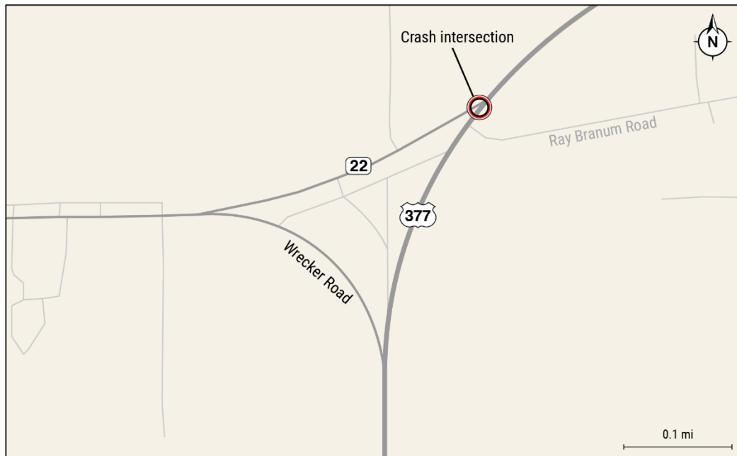
Figure 3. Junction of SH-22, Wrecker Road, and US-377 with crash location circled in red.