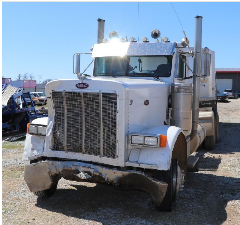
Figure 6. Postcrash photograph showing damage sustained by combination vehicle.

1.5.2.2 Damage. The truck-tractor sustained contact damage across its entire front, primarily at bumper height. There was contact deformation beginning near the passenger-side frame rail attachment point and extending across the bumper to the driver's side. The face of the bumper had contact damage and was displaced at the lower edge (bottom) rearward. There was additional contact damage to the passenger side of the hood's vertical face (above the headlamps) and to the leading surface of the right-front fender. Postcrash photographs showed that the left steer axle tire was deflated; the remaining nine tires on the combination vehicle were intact and in operational condition (see figure 6).