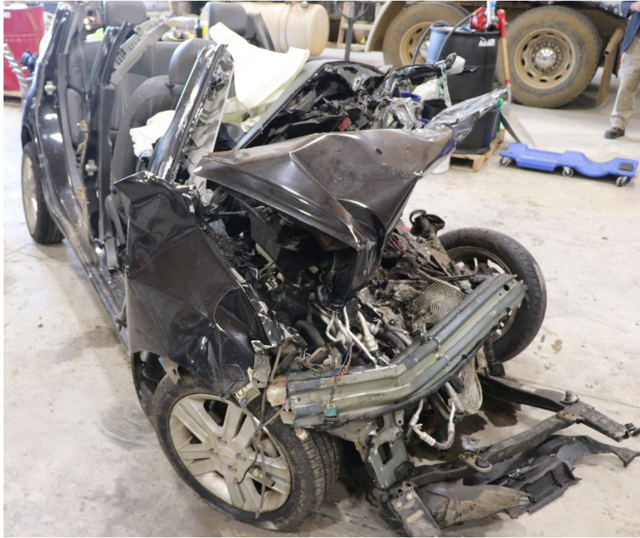
Figure 4. Postcrash photograph of damage to passenger car. The photograph was taken after the car had been moved to a garage.

First responders removed the roof, rear hatch, passenger-side front and rear doors, and driver-side front and rear doors.