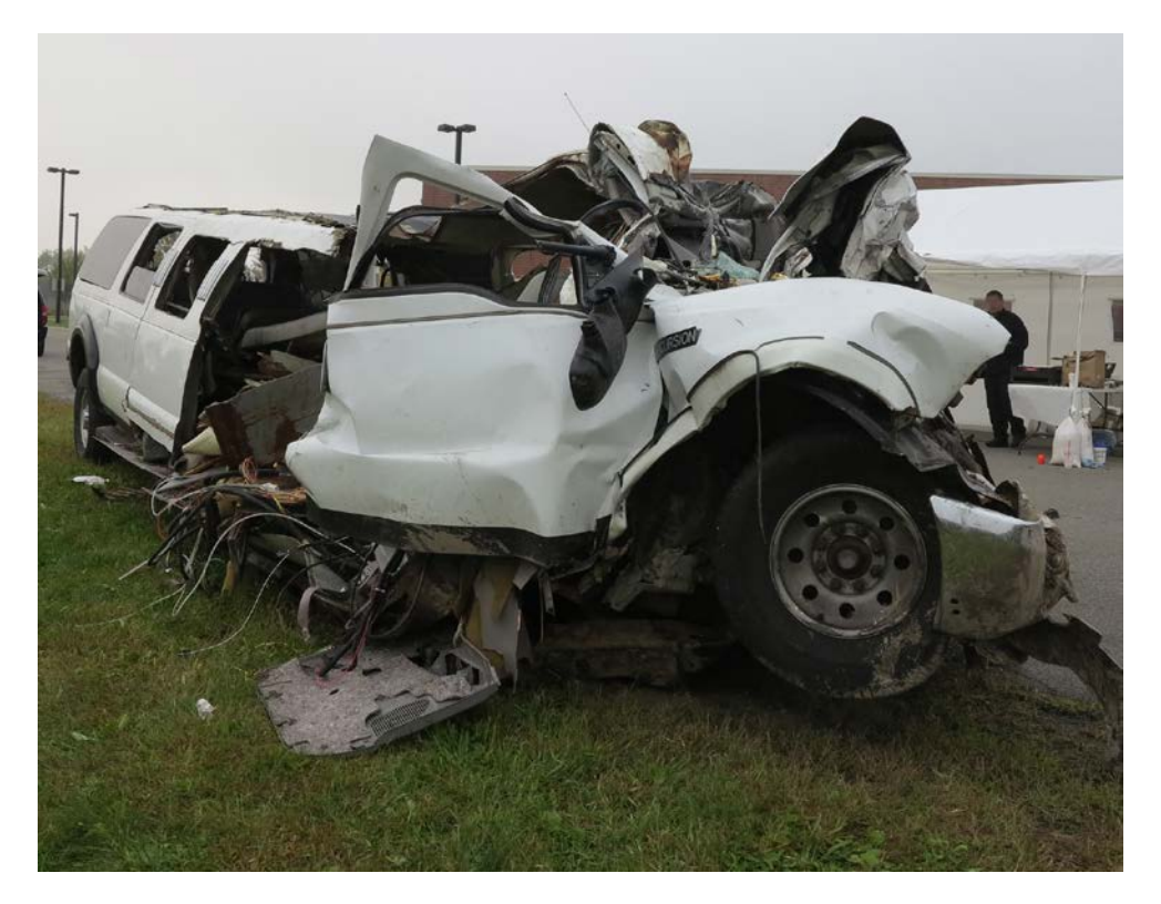
Figure 2 . Postcrash passenger side view of the 2001 Ford Excursion limousine (not in the crash final rest position).

Figure 1. Postcrash front view of the 2001 Ford Excursion limousine (not in the crash final rest position).