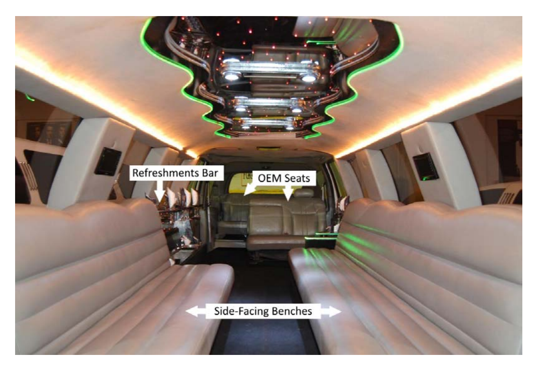
Figure 4. A 2010 photograph of the limousine's interior, looking from the front of the vehicle toward the rear of the passenger compartment.

The three non-OEM bench seats were equipped with passenger lap belts; the OEM seats retained their original lap/shoulder belts on the outboard seats and lap belts on the middle seats. According to a NYSDOT vehicle examination report, the vehicle's total seating capacity was 18 occupants.<sup>6</sup> The NTSB's postcrash inspection of seat belt anchor points indicated 21 belted seating positions in the vehicle. NTSB investigators noted that the seating positions available in the vehicle could range from 18 to 22, depending on how a position is defined.<sup>7</sup> On the day of the crash, all 17 limousine passengers were seated within the passenger compartment. Evidence from first responders and postcrash examinations of victims indicated that none of the passengers were wearing the passenger lap or lap/shoulder belts at the time of the crash.<sup>8</sup>