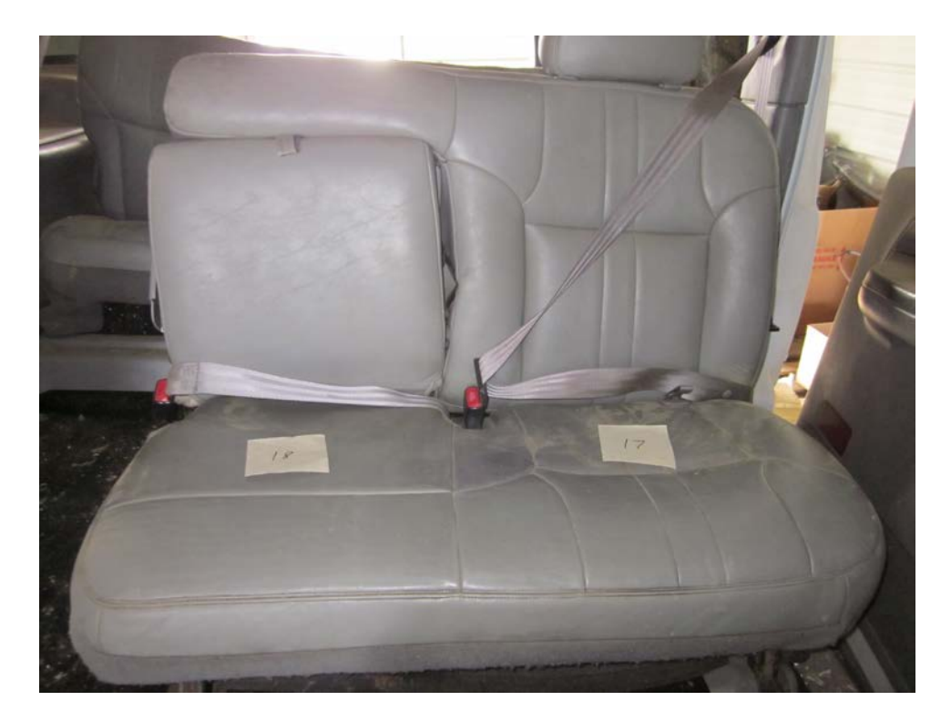
Figure 7 . The rear OEM seats, which were deformed during the crash but remained structurally intact and attached to the floor. (Although the seat belts appear latched in this photograph, they were not found fastened after the crash.)

Figure 6. Right-side bench seat frame, with a closeup view of the damage to the seat frame anchor strap.