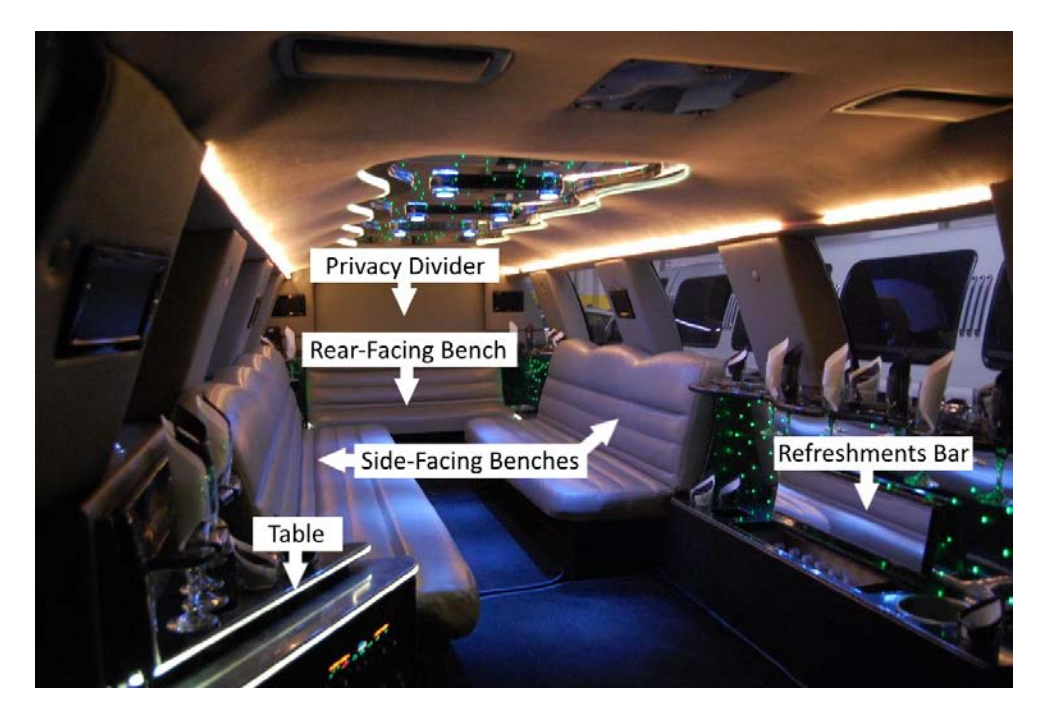
Figure 3. A 2010 photograph of the limousine's interior, looking from the rear of the passenger compartment toward the driver's compartment. The view to the driver's compartment is blocked by a white privacy divider.

The driver and front passenger seats provided by the OEM were retained, as well as five of the six rear OEM passenger seats. A privacy divider was added between the driver's seat and the passenger compartment. In the stretched portion of the vehicle, a rear-facing bench seat was added, abutting the privacy divider and facing into the passenger compartment (see figure 3). In addition, side-facing bench seats were installed along each side of the compartment, forming a perimeter seating layout (see figures 3 and 4). The side-facing bench seat on the passenger side was shorter than the one on the driver side, and a refreshments bar was installed next to this bench seat and forward of the passenger-side rear door. A small table was also added next to the driver-side side-facing bench seat. The back of the limousine consisted of five Excursion OEM rear seats that faced forward (see figure 4). The OEM seat next to the rear door on the passenger side was removed to allow access to the rear of the passenger compartment.