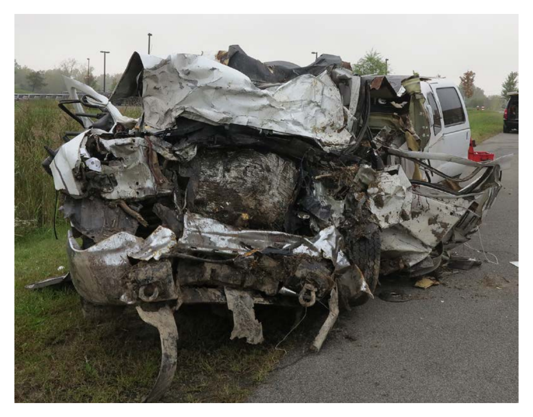
Figure 1. Postcrash front view of the 2001 Ford Excursion limousine (not in the crash final rest position).