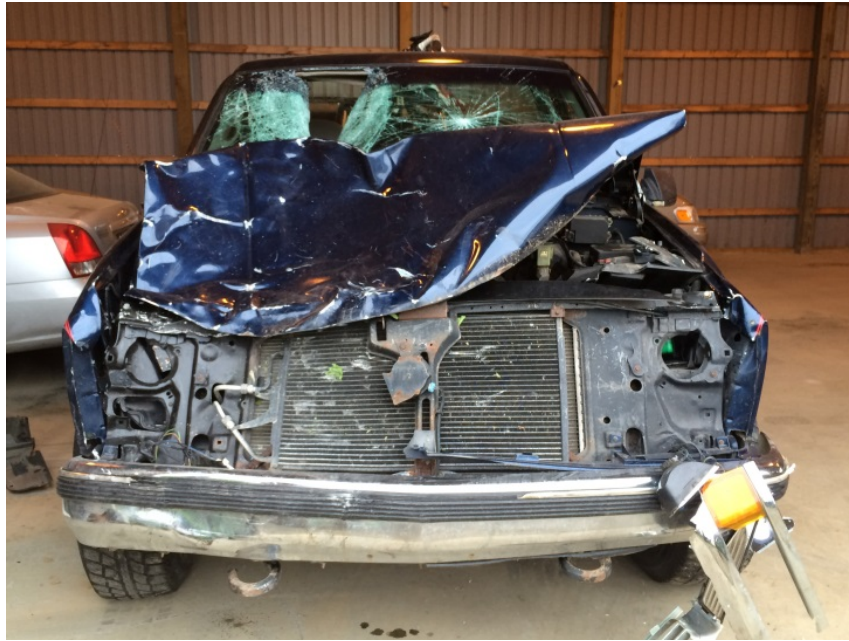
Figure 2. Front view of the pickup truck, showing damage from impacts. (Note that some of the damage resulted from two previous crashes in which the pickup truck was involved immediately prior to the subject crash involving the bicyclists.)

As a result of the crash, five of the cyclists were fatally injured, and the other four sustained serious injuries. The driver of the pickup truck was hospitalized for evaluation of his impaired condition.