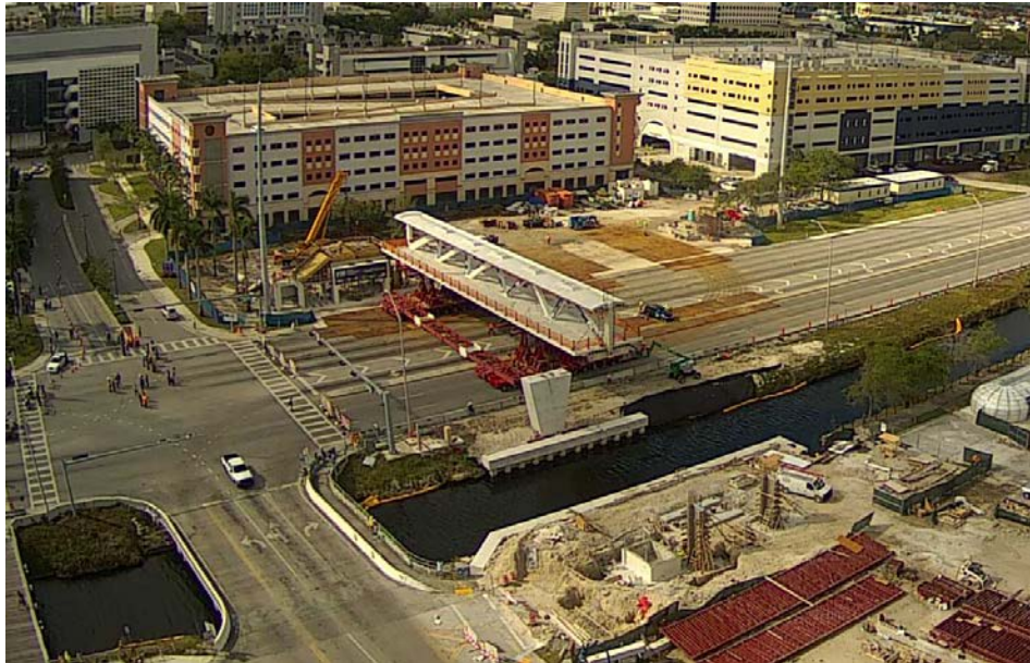
Figure 2. View of transporters moving the pedestrian bridge into place on the bridge piers.

The bridge was to be completed by early 2019 and was built using an accelerated bridge construction method—a technique intended to minimize disruption of traffic. On March 10, 2018, the walkway, diagonals, and canopy comprising the bridge, which had been built in a lot adjacent to SW 8th Street, was moved from the lot, using transporters, into position across the roadway and then lowered onto bridge piers on either side of the roadway (figure 2). 2 Traffic on SW 8th Street was detoured during the installation period, and the entire roadway was closed to facilitate movement of the structure.