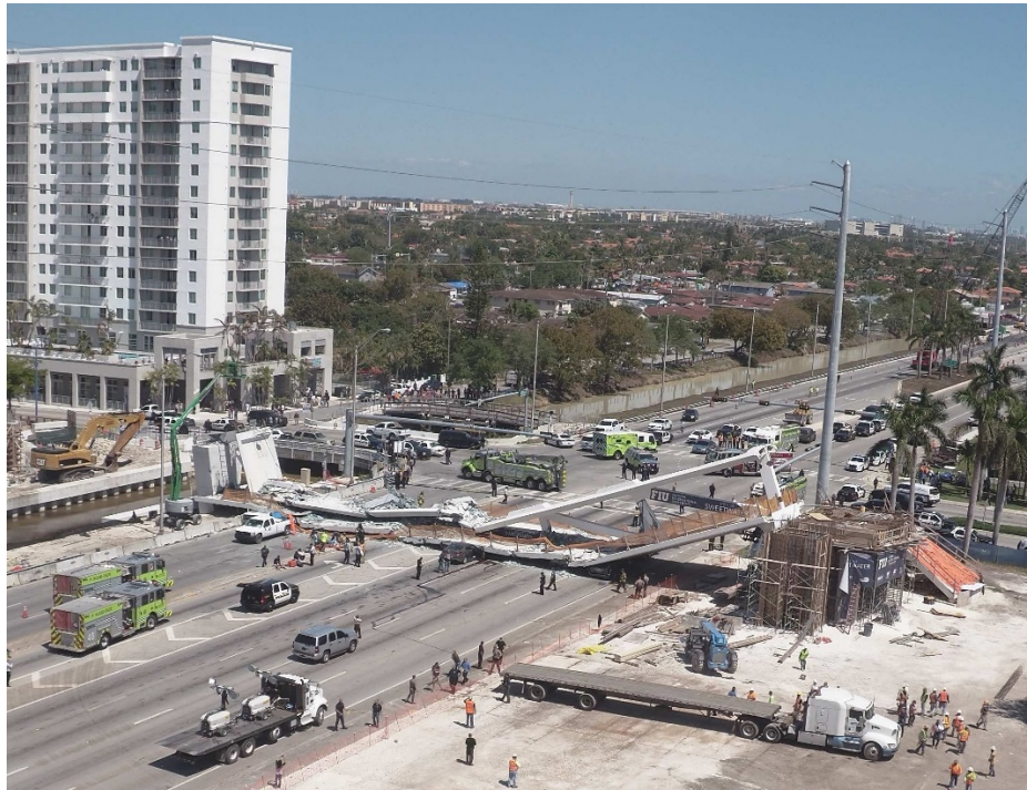
Figure 1. View of collapsed pedestrian bridge.

On Thursday, March 15, 2018, about 1:47 p.m. eastern daylight time, a partially constructed pedestrian bridge crossing SW 8th Street—an eight-lane roadway—in Miami, Florida, experienced a structural failure. 1 As a result, the 174-foot-long bridge fell about 18.5 feet onto SW 8th Street (figure 1). Eight vehicles that were stopped below the bridge at the time of the collapse were fully or partially crushed; seven of those vehicles were occupied. As a result of the bridge collapse, one bridge worker and five vehicle occupants died. Four bridge workers and four other people were injured.