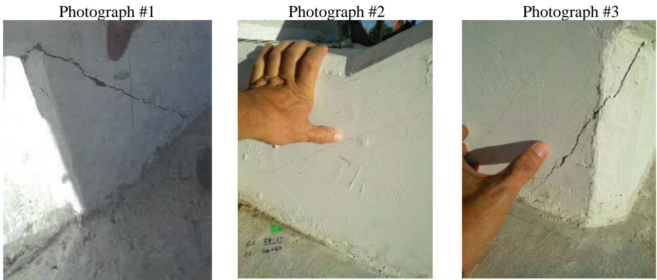
Figure 4. Photographic documentation of the crack in the region of bridge diagonal 11.

In the next month, the NTSB will be conducting additional forensic examination of several bridge structural components and destructive testing of multiple core and steel samples. All aspects of the collapse remain under investigation while the NTSB determines the probable cause, with the intent of issuing safety recommendations to prevent similar events.