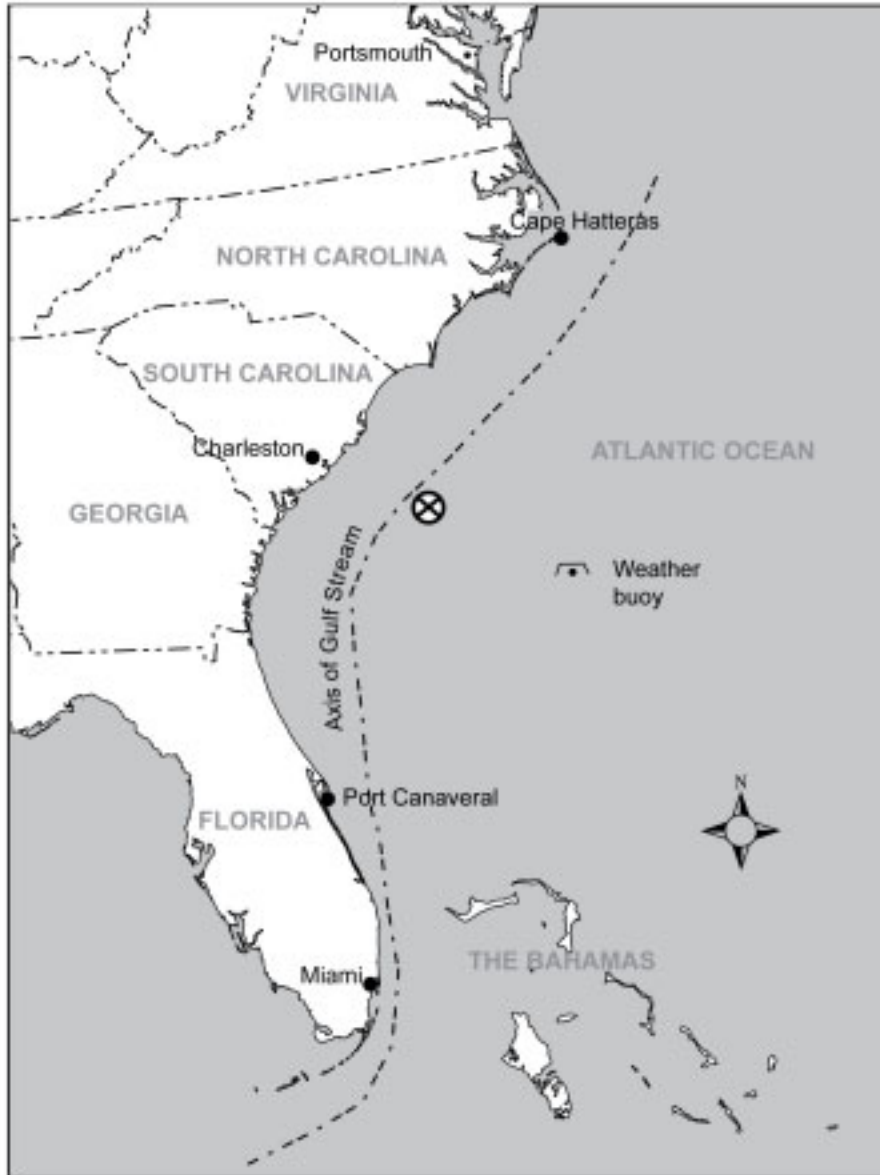
Figure 1. The Norwegian Dawn encountered heavy weather off the coast of South Carolina, in the area shown by an X , during its return trip from Miami to New York.

Weather. The crew received weather forecasts from the National Weather Service that predicted storm and gale conditions for the vessel's intended path from Miami to New York, with wind speeds from the north at up to 40 knots and waves between 14 and 28 feet high. Higher waves were predicted along the main axis of the Gulf Stream. On the afternoon of April 15, the Norwegian Dawn 's master moved the ship's route farther offshore to avoid the predicted weather conditions. According to the vessel's chief engineer and the hotel director, the master notified the crew and passengers at 1000 on April 15 that rough weather was forecast. Deck log entries indicate that such notification was given throughout the day.