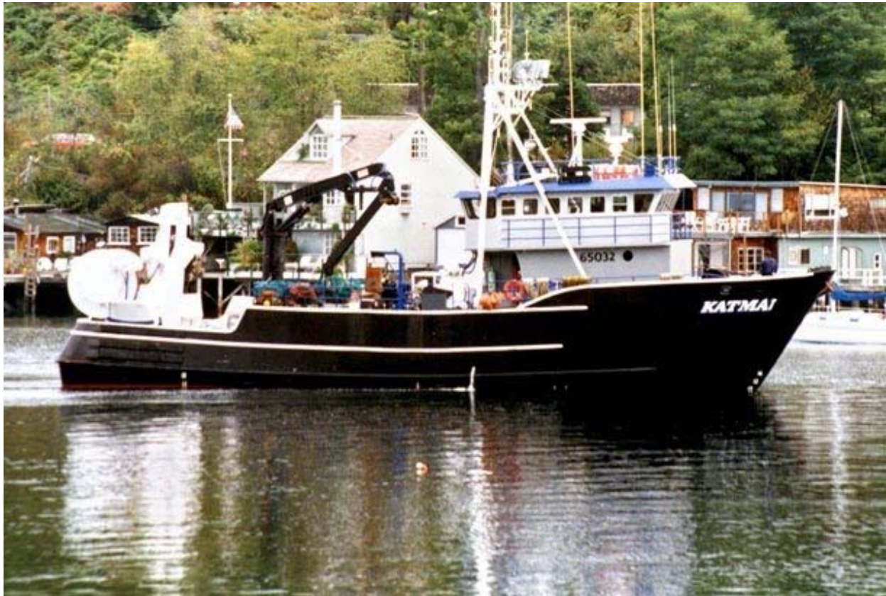
Figure 1. Fishing vessel Katmai motoring through Ballard locks in Seattle. White cylindrical structure (net reel) at stern was later removed when vessel was refitted for cod fishing. Katmai was the only vessel owned and operated by Katmai Fisheries, Inc.

NTSB and Coast Guard investigators examined one of the vessel's two liferafts, which had been taken to Anchorage after it was recovered.