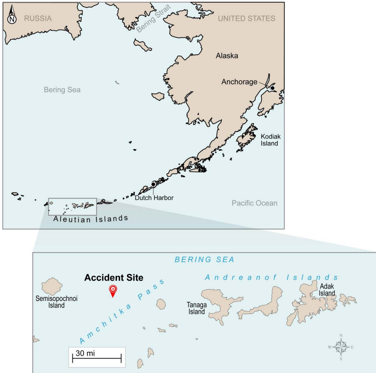
Figure 2. Area of Bering Sea where Katmai sank, with detail showing accident site, Amchitka Pass, and nearby islands.

recognized that the vessel was in danger from the oncoming storm, he could have sought shelter in the lee of Semisopochnoi Island.