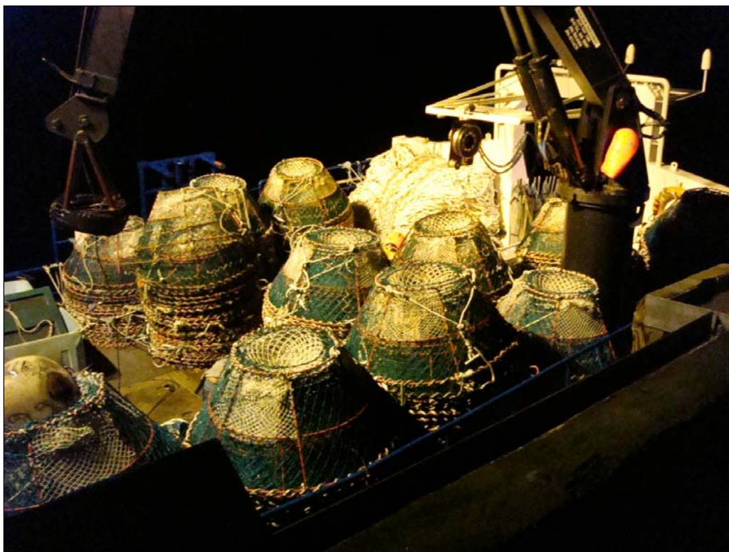
Figure 4. Cod pots on Katmai 's fishing deck, looking aft.

Stability analyses of the Katmai were conducted in October 1993 and July 1996 after the processing space and new pilothouse, respectively, were added. The Katmai 's latest stability report did not account for modifications made in 1998 or thereafter and did not account for the change in fishery from shrimp to Pacific cod. For instance, the stability report for the Katmai should have accounted for the weight of the cod pots kept on the fishing deck (figure 4). Testimony indicated that 420–450 cod pots were on the deck, weighing 37–43 pounds each. That, and other weight changes, meant that the precalculated loading conditions described in NVIC 5-86 and provided in the stability report for the Katmai master's use were inaccurate and therefore should not have been used. The wind profile of the cod pots should also have been accounted for in the stability report, as it increased the area subject to beam winds, necessitating an additional measure of stability. Ultimately, this additional sail area would likely have reduced the maximum cargo load allowed. The postaccident stability assessment conducted by the MSC showed that—with the wind area for the cod pots included—the Katmai did not meet the severe wind and roll stability criteria of 46 CFR 28.575 in all loading conditions described in the stability report.