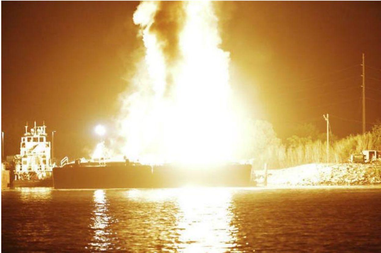
The accident scene.

Three people sustained serious burn injuries: (1) The ORC PIC, who was standing on the deck of the Kirby 28182 ; (2) a Safety Runner deckhand, who was standing on the starboard side of the Safety Runner 's main deck near the emergency shutdowns; and (3) the radio technician from the Ricky J Leboeuf , who was standing on land immediately in front of the Safety Runner . On shore, ORC personnel and the Safety Runner crew moved away from the burning tug and barges, aided the injured, and contacted emergency response agencies. Between 2030 and 2057, local fire and police departments received notifications and responded to the scene. At 2057, another explosion occurred, damaging nearby structures and first-responder vehicles. Emergency responders then evacuated all persons from neighboring buildings and vessels within a 1-mile radius. Coast Guard Sector Mobile closed the mouth of the Mobile River to vessel traffic and established a safety zone around the accident scene. The two Kirby barges burned for more than 6 hours and sustained several more explosions. Shortly after sunrise on the morning of April 25, 2013, the Mobile Fire Department declared the area safe for responders.