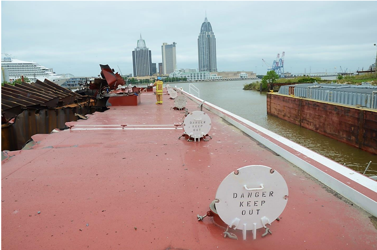
Open tank hatches on Kirby 28194, photographed after the accident, through which flammable vapors were being vented. Undamaged barge DM 976 can be seen on the right.

One of the ORC employees later told investigators that, sometime between 2000 and 2030, an air hose disconnected from one of the fans on board Kirby 28182 , and the fan malfunctioned. He recalled that the PIC shut down two dockside compressors that powered the fans before they investigated the fan malfunction. He said that while the PIC examined the fan, the captain of the Safety Runner pulled his vessel into the facility between Kirby 28194 and DM 976 to drop off a radio technician. The captain of the Safety Runner later told Coast Guard investigators that he was unaware of the tank-cleaning operation in progress.