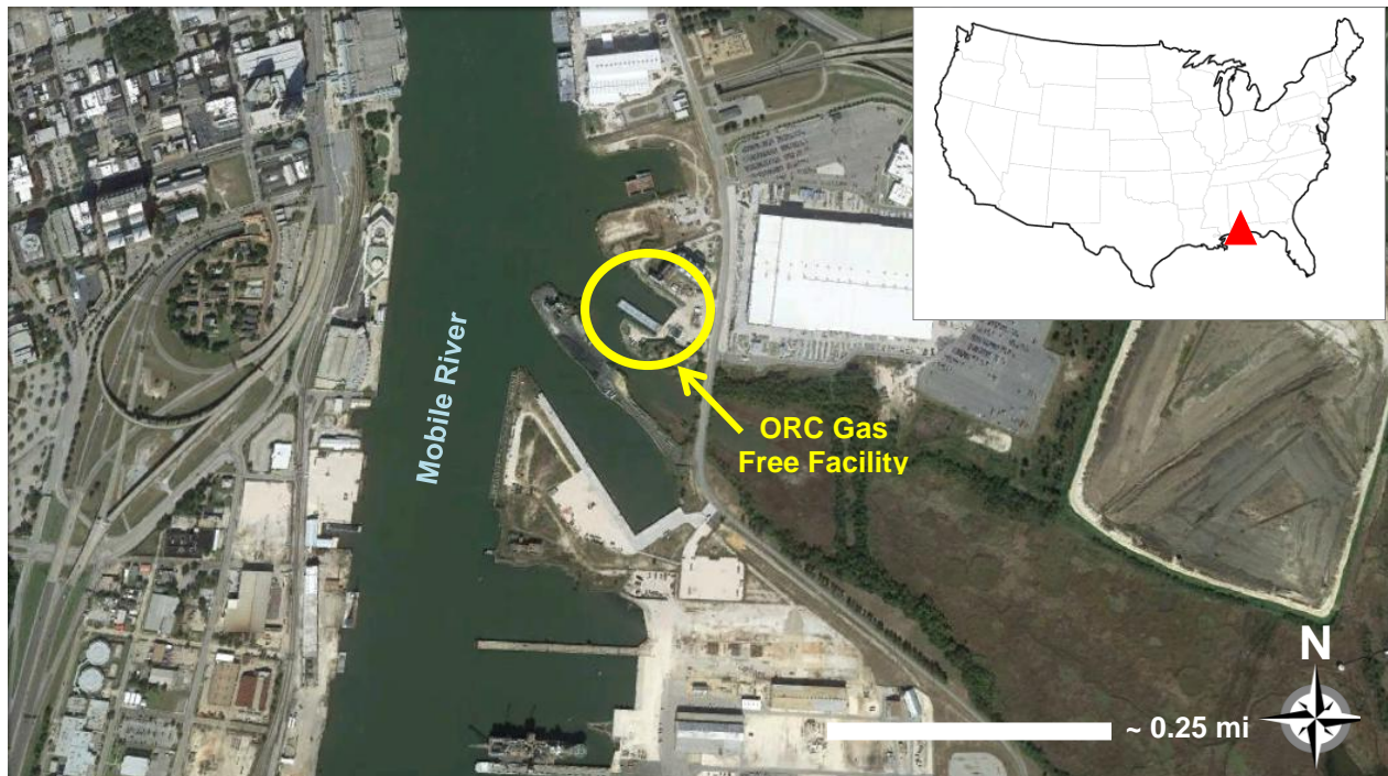
Aerial image of a section of Mobile, Alabama. The ORC Facility, located on the east side of the Mobile River, is circled in yellow.

At 0030 on the morning of April 24, 2013, the towing vessel Ricky J Leboeuf delivered Kirby barges 28182 and 28194 to the Oil Recovery Company (ORC) Gas-Freeing Marine Terminal (“ORC Facility”) in Mobile for tank cleaning. The two barges held a total of about 11 barrels (462 gallons) of residual natural gasoline, a liquid, flammable, first-distillation of crude oil. After drop-off, the Ricky J Leboeuf remained at the stern of the two barges.