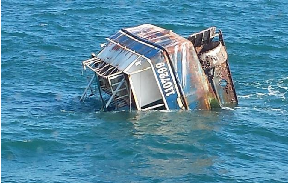
The Miss Eva sinking bow first.

The Miss Eva remained afloat and burning. A sister vessel, the commercial fishing vessel Nikolas , arrived on scene to attempt to salvage the Miss Eva 's cargo. The Nikolas ' master noticed that the Miss Eva 's bulwarks and hull plating were pushed outward, which he believed were signs of an explosion. About 4 to 6 hours after the fire started, the Miss Eva sank bow first in water about 60 feet deep near Ship Shoal Block 154. The Miss Eva was not salvaged.