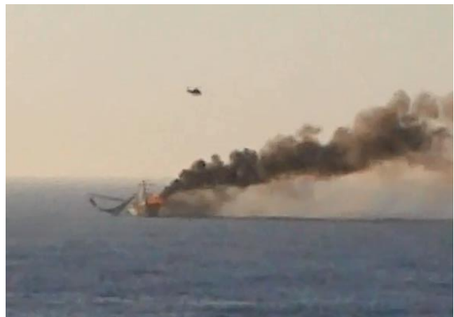
The left photo shows the Miss Eva 's liferaft located above the wheelhouse. The right photo shows the Miss Eva on fire with an Era helicopter circling the liferaft and the vessel.

At 0920, a Coast Guard HH65 (6581) Dolphin helicopter arrived at Ship Shoal 154-E and medically evacuated the master, who was the most critically injured crewmember. He was transported to the burn unit at Baton Rouge General Medical Center, Baton Rouge, Louisiana. A second Coast Guard HH65 Dolphin helicopter (6538) arrived about 1000 and medically evacuated the remaining crewmembers. The senior deckhand and the deckhand were also transported to the burn unit at Baton Rouge General Medical Center, and the junior deckhand was transported to West Jefferson Medical Center, Marrero, Louisiana, for medical evaluation.