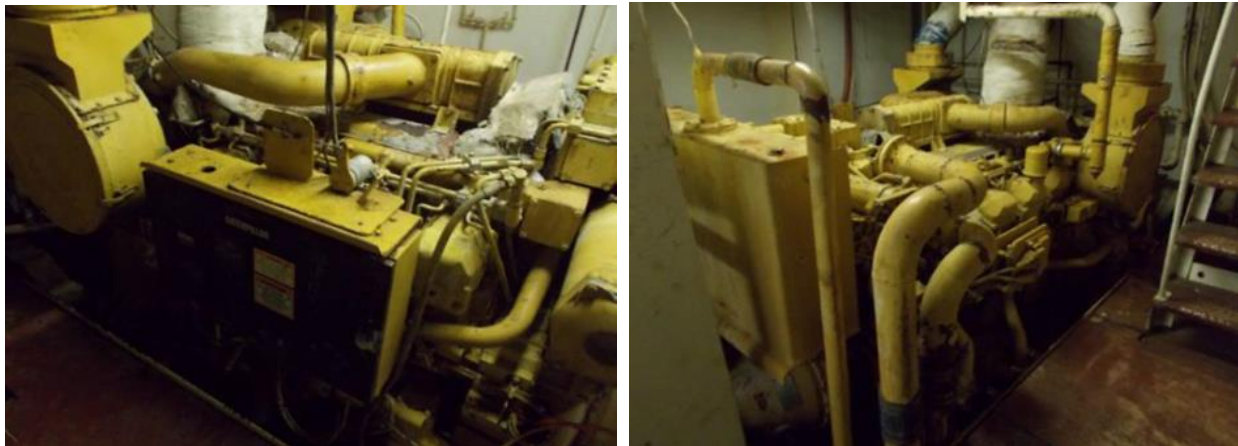
The Miss Eva 's Caterpillar 3508B main propulsion engine.

The Miss Eva was outfitted with one Caterpillar model 3508B marine four-stroke cycle diesel engine. The engine room had natural ventilation through scuttles and ventilation openings and was equipped with a mechanical blower. An alarm panel in the engine room provided aural and visual annunciations for main engine oil pressure, main engine water level, main engine water temperature, and generator water levels. A secondary alarm panel, which was located in the wheelhouse, also provided the same aural and visual annunciations. The Miss Eva was not fitted with a fixed fire extinguishing system. The owner and operator stated that smoke detectors were installed in the galley and the centerline passageway leading to the aft exit. The vessel was equipped with seven Coast Guard-approved portable fire extinguishers (weighing between 5 and 15 pounds) that were located in the wheelhouse, galley, and engine room.