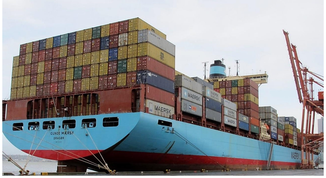
The 9,700 TEU Gunde Maersk at berth 37 in Seattle, Washington, on December 10, 2015.2

On December 8, 2015, at 0509 local time, a fire broke out in auxiliary engine room no. 1 on board the containership Gunde Maersk shortly after the vessel departed Terminal 46 in Seattle, Washington. The fire was quickly extinguished by the vessel's high pressure water mist system. As a result of the fire damage, the vessel lost propulsion and required tugboats to return to its berth. There was no environmental damage and none of the 23 crewmembers were injured. Damage was estimated at $380,000.