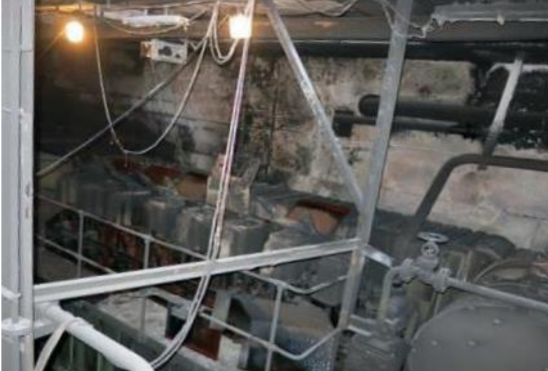
Fire damage to auxiliary engine no. 1. Left photo shows inboard side, looking forward; right photo shows the outboard side, looking aft.