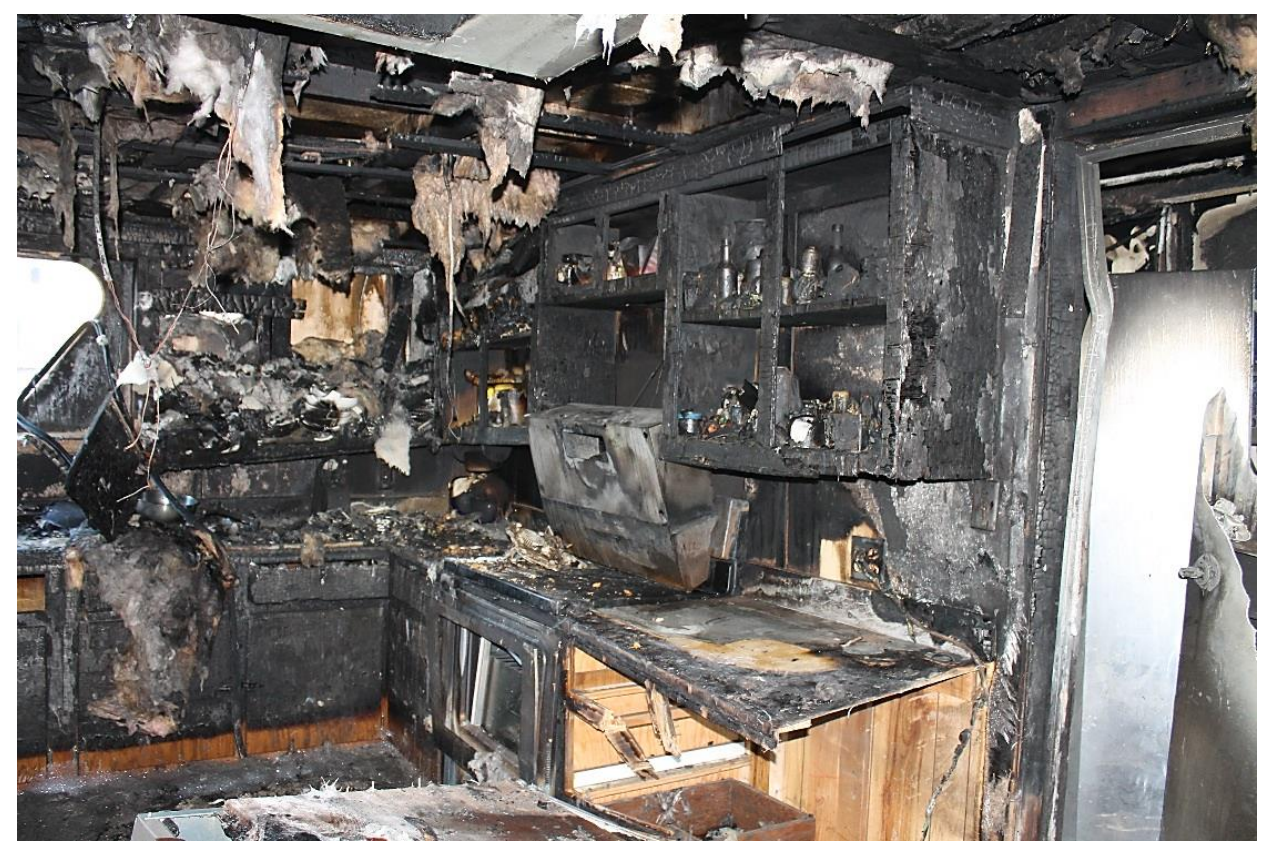
Fire damage to the San Gabriel galley located on the main deck.

The morning after the fire, investigators and the Harris County fire marshal boarded the San Gabriel after dewatering was complete. They found charred interior spaces on the main deck, quarters deck, and wheelhouse deck. The heaviest heat, smoke, and water damage was located on the main deck.