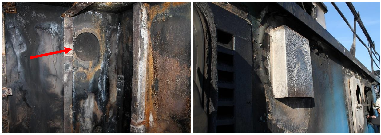
At left, the opening where exhaust fan had been mounted inside lavatory. At right, heat damage to painted surface of exterior bulkhead around exhaust ventilation duct.

Based on a fire-pattern analysis, fire damage survey, and witness statements, the fire marshal concluded that the fire had originated in the lavatory in the area of the exhaust fan. He observed hot spots and burn patterns on the outboard bulkhead under the exhaust fan opening that were not seen anywhere else in the lavatory. Nothing remained of the suspect fan, which was burned completely. The only identifiable objects found in the lavatory debris were a ceramic toilet, fluorescent light fixture, an electrical outlet, wood framing, and small pieces of copper. There were visible signs of heat distortion of the forward port bulkhead at the top by the air conditioning ventilation duct penetrations. The aft starboard bulkhead had separated from the deck due to the heat.