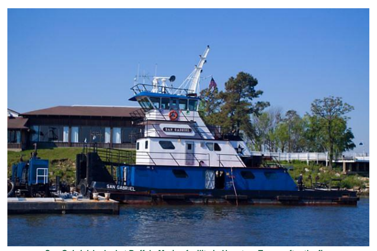
San Gabriel docked at Buffalo Marine facility in Houston, Texas, after the fire.

About 2220 on February 26, 2016, a fire broke out in the engine room lavatory on board the uninspected towing vessel San Gabriel while moored at a sulfur-loading dock in Houston, Texas. Shoreside firefighters extinguished the blaze, which caused extensive damage to the interior spaces. All crewmembers were able to evacuate the vessel safely, and no pollution was reported as a result of the fire.