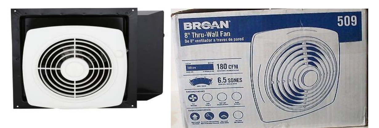
Broan fan, model 509.

The 180-cubic-feet-per-minute, 8-inch through-wall exhaust fan in the lavatory was manufactured by Broan, model 509. According to a representative from the San Gabriel 's operating company, Buffalo Marine Service, the unit had been installed by an electrician in the shipyard in October 2014 to replace a failed unit. The fan manufacturer's specifications stated that the fan motor drew 1.5 amps and was not "engineered for continuous usage." Crewmembers stated that they typically had shut off the fan after use, but there were times when it had been left on.