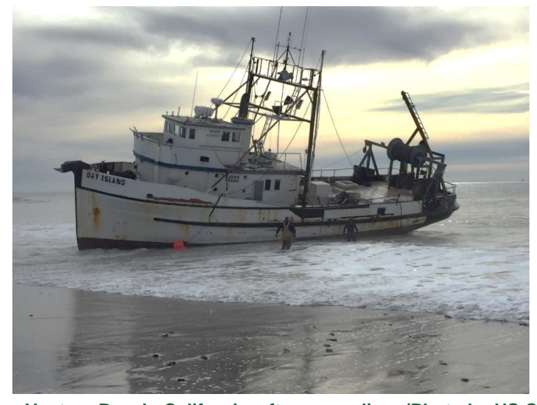
Day Island on Ventura Beach, California, after grounding.

On January 10, 2016, at 2035 Pacific standard time, the uninspected commercial fishing vessel Day Island ran aground on Ventura Beach, California, in light seas. At the time of the accident, the vessel was en route to the commercial docks in Ventura Harbor, about a mile and a quarter south of the grounding location. The captain, who was operating the vessel, told investigators that he had fallen asleep about 30 minutes before the grounding and was awakened when the vessel ran up on the shore. After an unsuccessful attempt to refloat the vessel, the three crewmembers abandoned the Day Island and waded ashore with the help of local rescuers. None of the crewmembers were injured, and no environmental damage was reported. The vessel was intentionally destroyed during its removal from the beach.