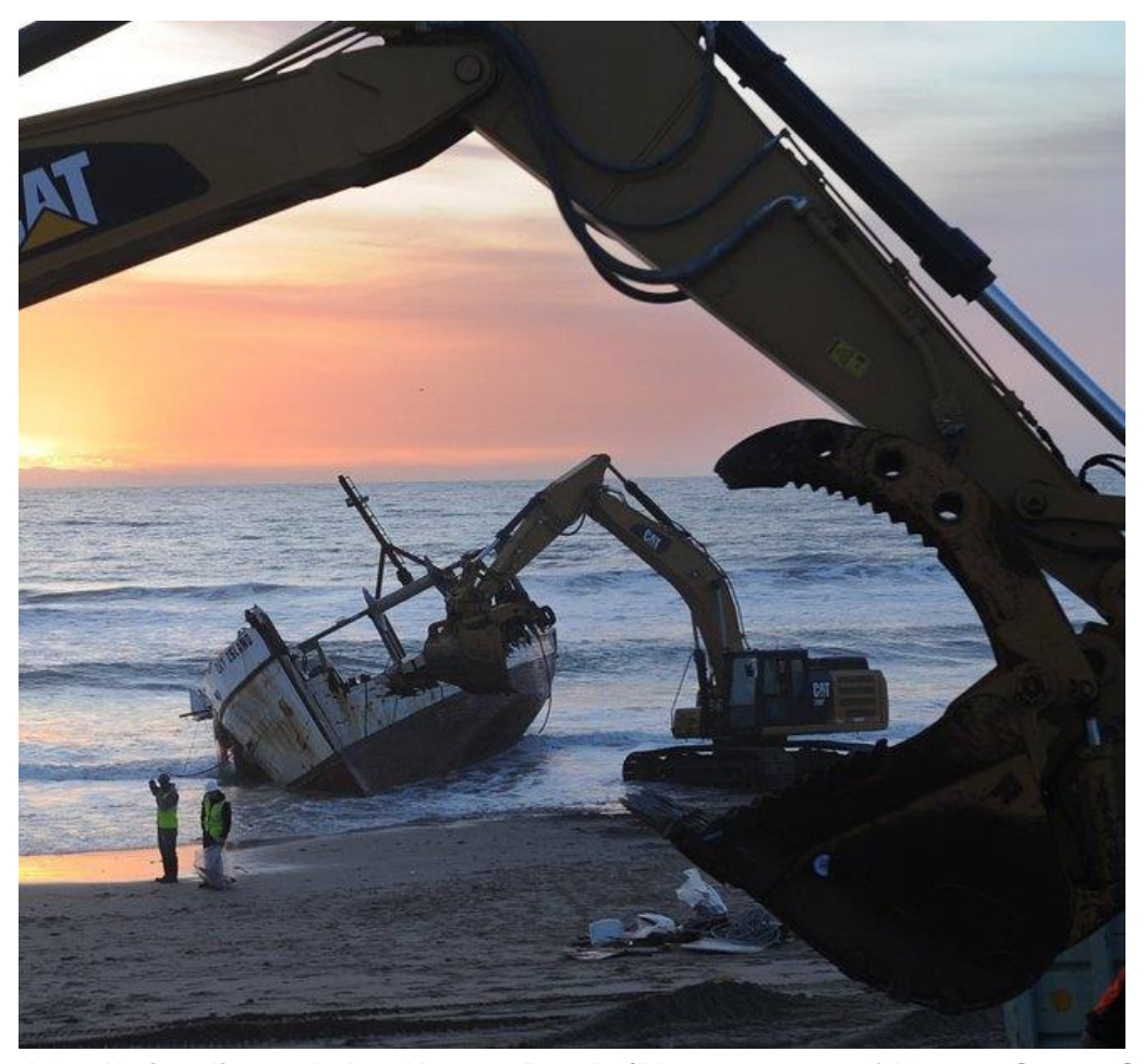
Day Island being dismantled on Ventura Beach.