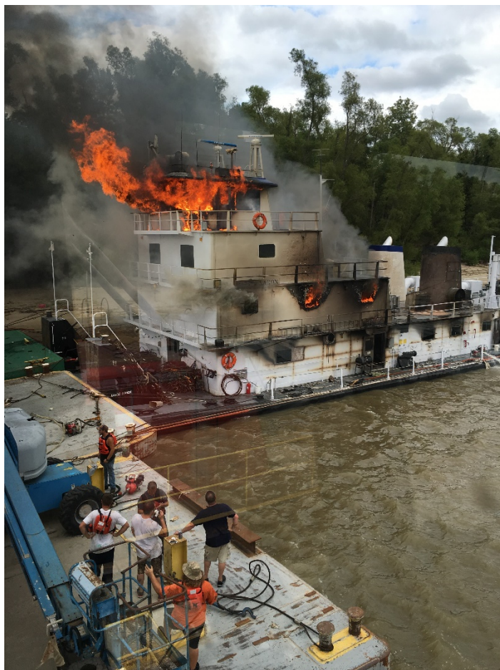
Jaxon Aaron on the right descending bank during the firefighting effort.

The cause of the fire was determined to be a catastrophic failure of components of the no. 15 power assembly or “power pack” on the port main diesel engine. As with most other large internal combustion engines used in marine or other industrial services, this engine was designed to allow replacement of the cylinder head assembly, cylinder liner, piston, piston rings, and piston rod without removal of the entire engine. These parts were pre-assembled into a power pack unit, which then could be removed or installed during a maintenance period. When the no. 15 power assembly was removed from the main diesel engine of the Jaxon Aaron after the fire, severe damage was found in the cylinder head and the lower casing.