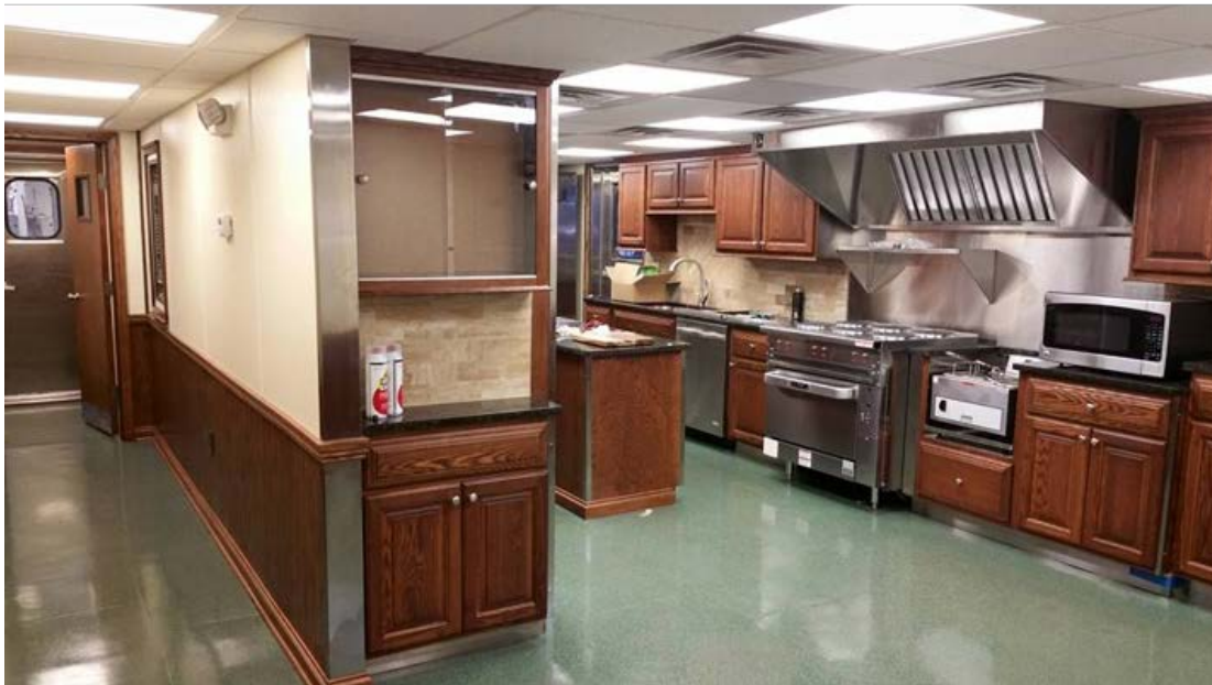
Crew lounge (at top) and adjacent galley area (at bottom) on the main deck of the Jaxon Aaron after renovations. The stainless-steel door (bottom, far left) is common with the upper engine room flat and located just aft of the chief engineer's stateroom.