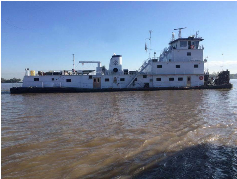
Towing vessel Jaxon Aaron before the fire.

About 1140 local time on August 13, 2016, a fire erupted in the engine room on board the uninspected towing vessel Jaxon Aaron while it was pushing a flotilla of 16 barges upbound on the Lower Mississippi River near mile marker (mm) 770, approximately 24 miles north of Memphis, Tennessee. The fire spread from the engine room into the accommodation area and wheelhouse, causing an estimated $10.2 million in damage to the interior spaces. All nine crewmembers evacuated the vessel safely to the barge flotilla. No pollution was reported.