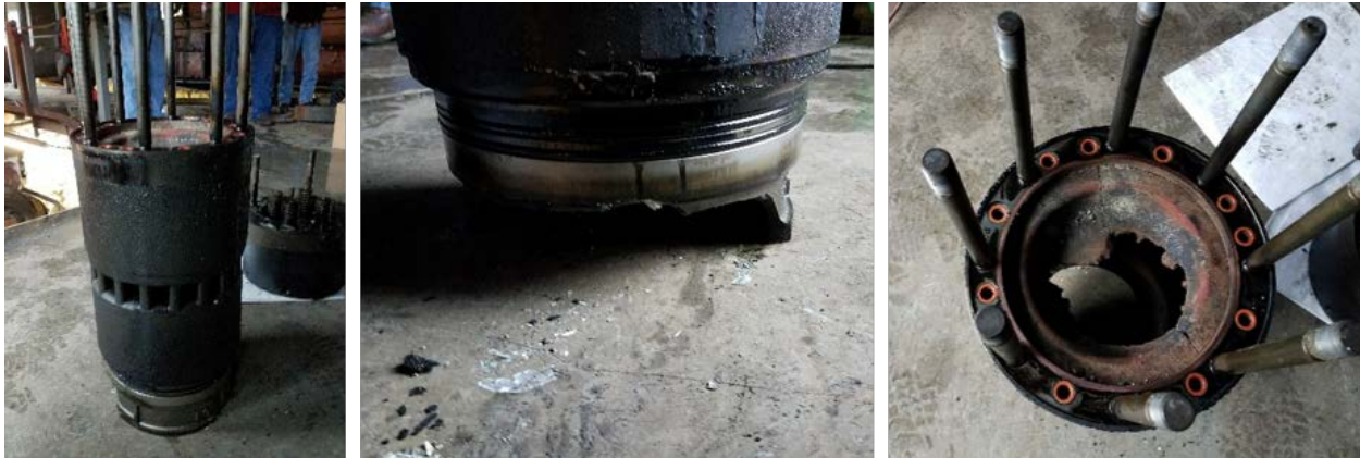
From left to right: (1) the power assembly of the no. 15 cylinder removed from the port main diesel engine, with the cylinder head and cylinder liner separated; (2) damage discovered to the lower casing of the assembly base; (3) the damaged cylinder head.

contamination using the black light fluorescence method. 3 This method will detect, but not precisely quantify, levels of water contamination.