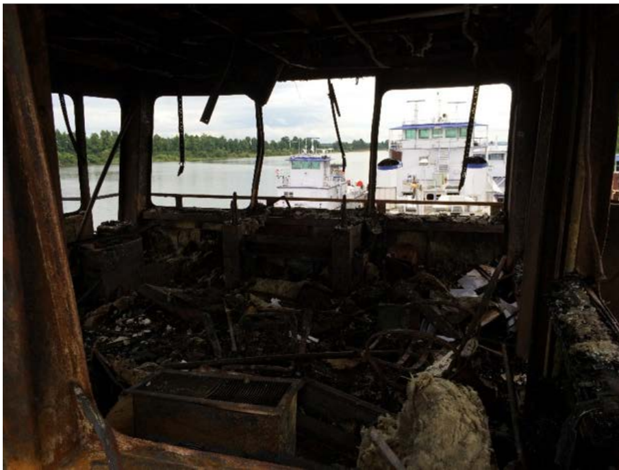
Fire damage to the Jaxon Aaron . At top, looking forward through both the stainless-steel door in the engine room and the opening where the window was located in the bulkhead between the chief engineer's stateroom on the main deck and the forward portion. At bottom, looking forward into the wheelhouse.