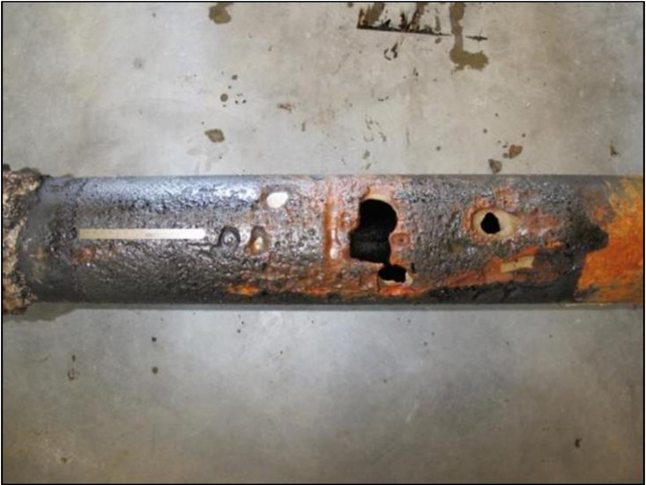
Figure 5. Large holes and corrosion damage on the top of the 6-inch-diameter water pipe

The water pipe was corroded and had three large holes through the pipe wall and concrete liner on the upper half of the pipe in the immediate area directly below the oil pipeline (see figure 5). The largest hole measured 5.1 inches around the circumference and had an irregular shape. The metal edges of the holes were rounded and oxidized. A corrosion pitted area extended about 16 inches upstream and downstream along the top and sides of the pipe from the center of the largest hole. The bottom of the pipe as well as the entire circumference upstream and downstream beyond the corroded area did not exhibit significant corrosion.