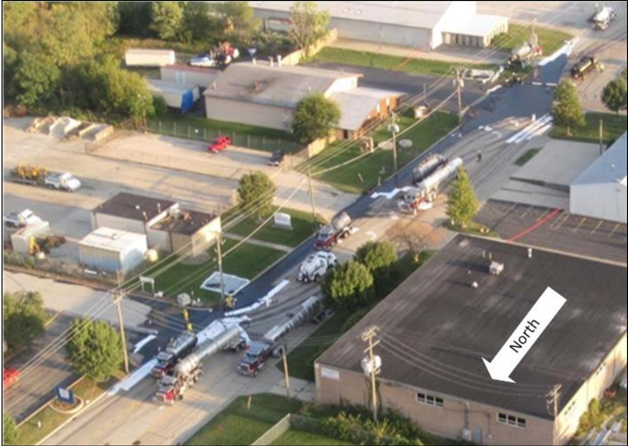
Figure 1. Aerial view of Parkwood Avenue looking southeast, September 9, 2010