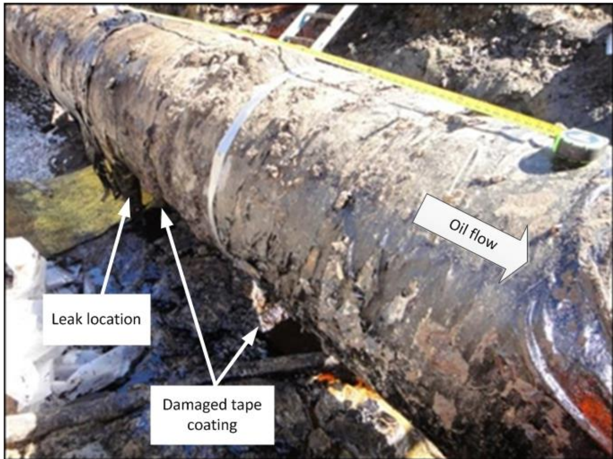
Figure 3. View of the damaged tape coating on the oil pipeline in the excavated trench

The oil pipeline tape coating was heavily damaged in the area above the water pipe, likely from the water jetting against it. Strips of ripped and disbonded coating and tape hung down from the sides of the pipeline in the vicinity of the leak location (see figure 3).