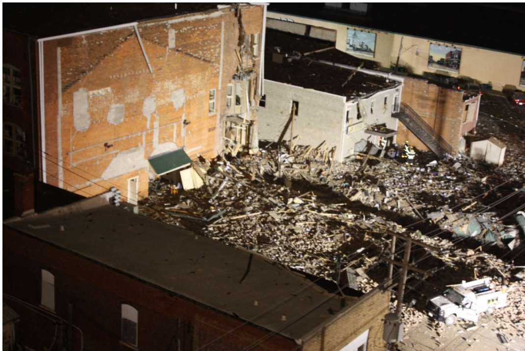
Figure 2. Photograph of the accident site and debris from the Opera House Annex.