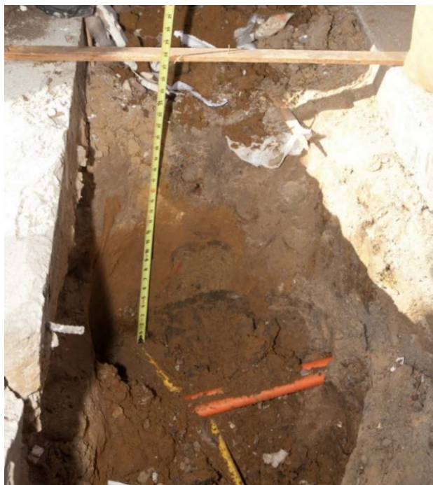
Figure 5. Image showing the damaged yellow service line intersected by the orange fiber optic cable conduit.

The crew leader was concerned about the failure to expose the gas line; however, he thought it would be adequate since the crew was drilling 30 inches underground or below the depth of the natural gas line that he believed was buried 18 inches. 7 (See figure 5.)