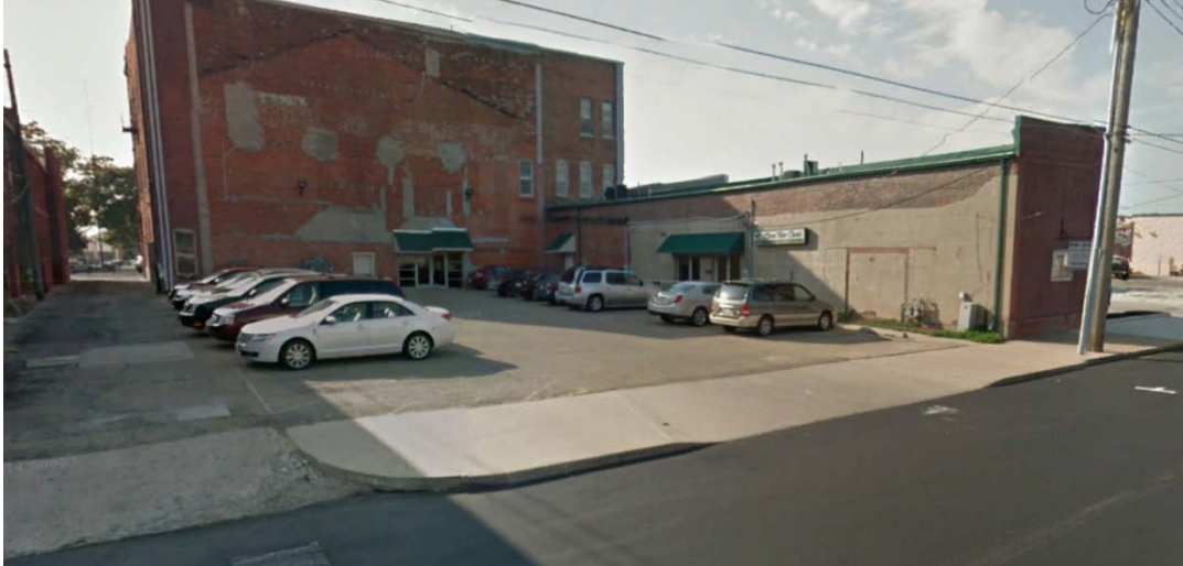
Figure 1. A Google Earth image of the back of the Opera House Professional Center and the two-level Opera House Annex prior to the accident.