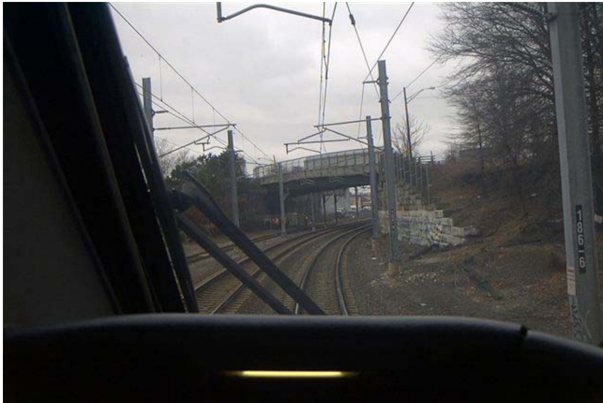
Figure 3. Engineer’s view eastbound on track 2, approaching the Charles Street Bridge. Point of impact was located under the bridge.

put into emergency. About 1:15 p.m., the Amtrak assistant superintendent called out “emergency” three times over the radio. The train was traveling 50 mph when it struck two workers; maximum allowable speed was 60 mph at this location.