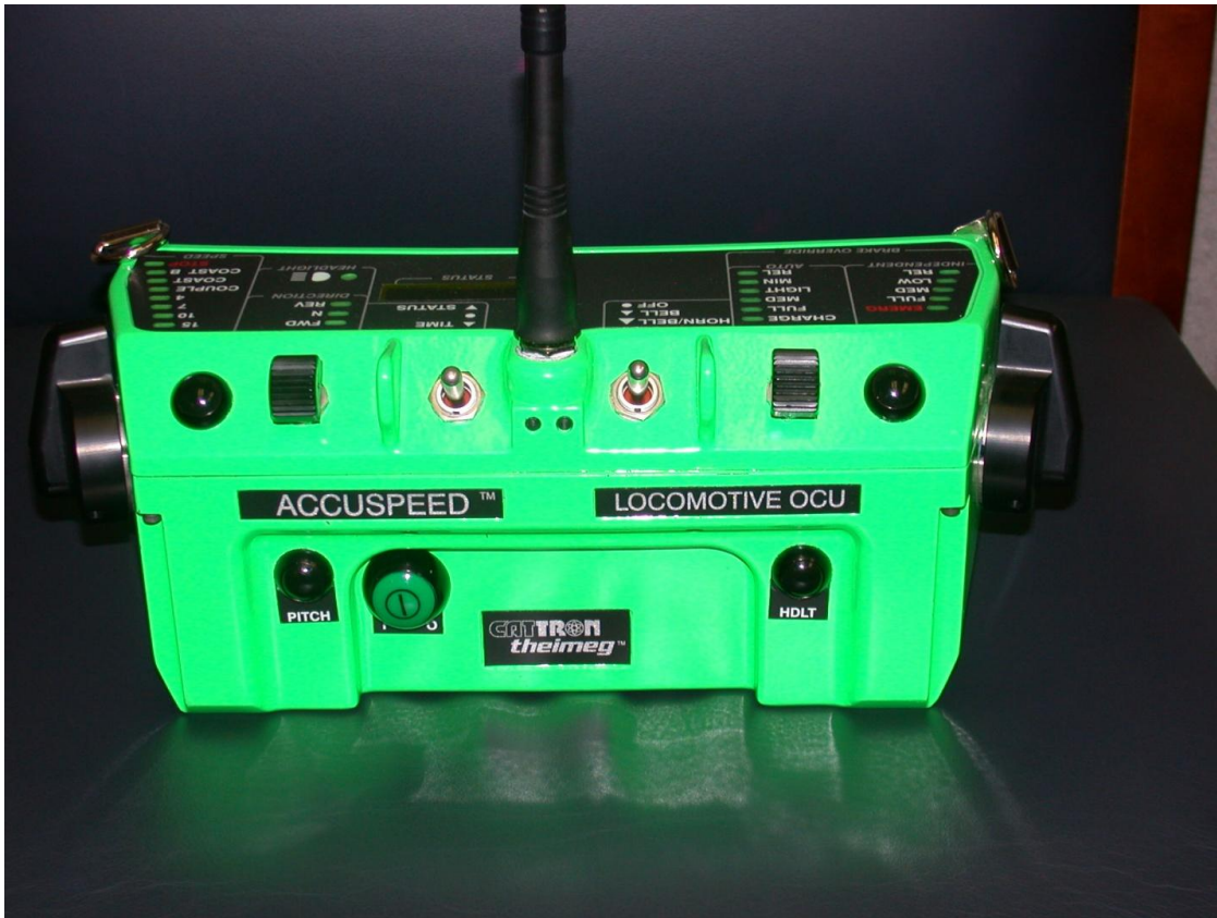
Figure 2. Cattron operating control unit.

The testing determined that the operation of the OCU was consistent with FRA Safety Advisory 2001-01 and that no inadvertent operation of the locomotive could be initiated from the OCU.