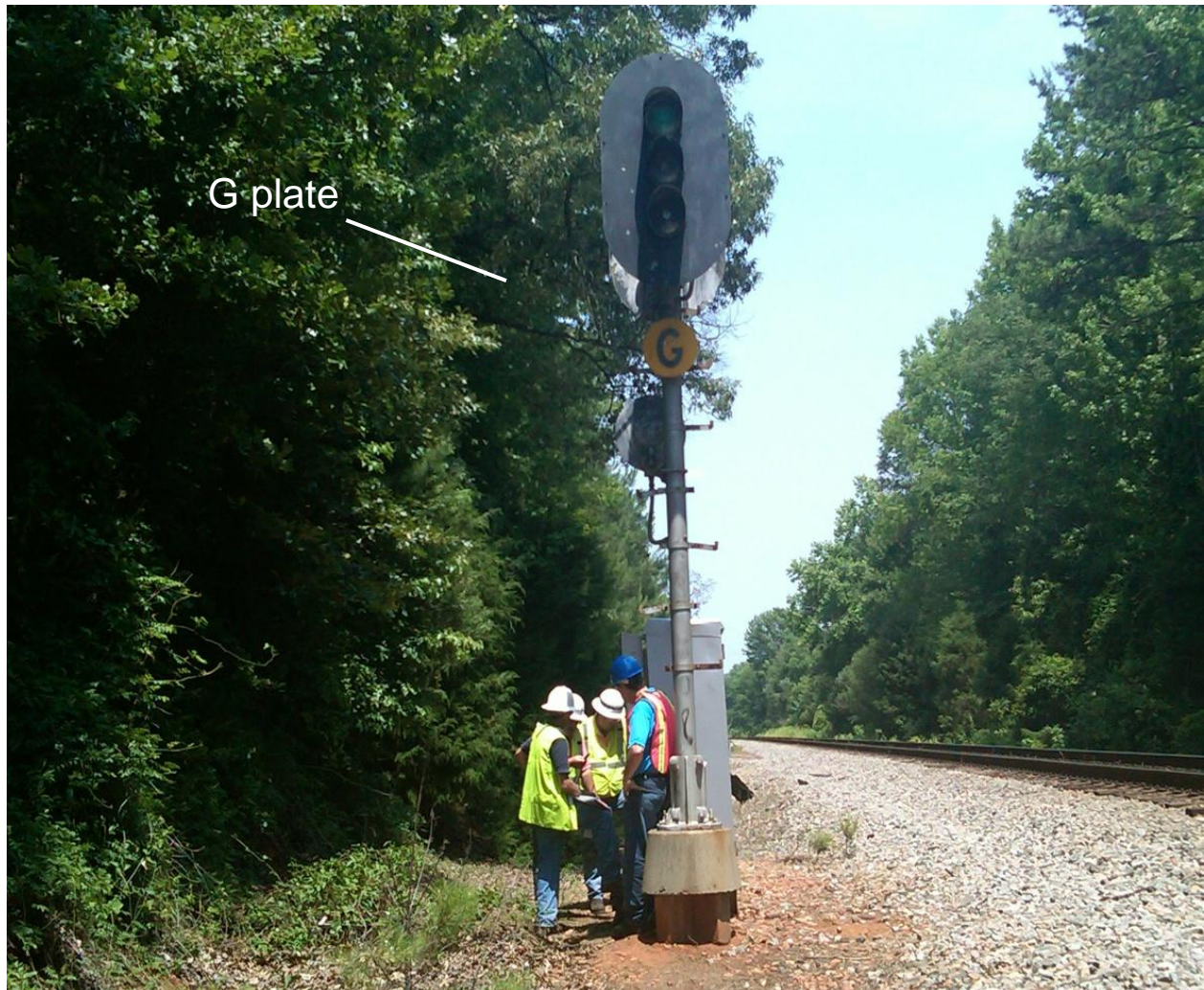
Figure 3. NTSB signal investigators inspecting signal at MP 316 with attached G plate.

48 mph just before the collision. Event recorder data showed no evidence that the engineer had applied the train's brakes before the collision.