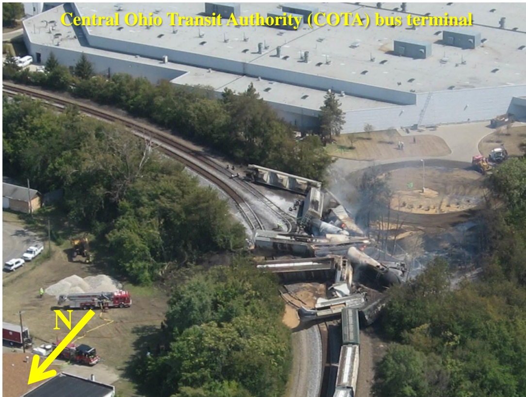
Figure 1. Aerial photograph of the derailment.

car fueled a large pool fire. The two other tank cars that were carrying denatured ethanol were engulfed in the pool fire and split open. Witnesses observed multiple energetic fire eruptions when these two tank cars ruptured. (See figure 1 for an overview of the accident scene.)