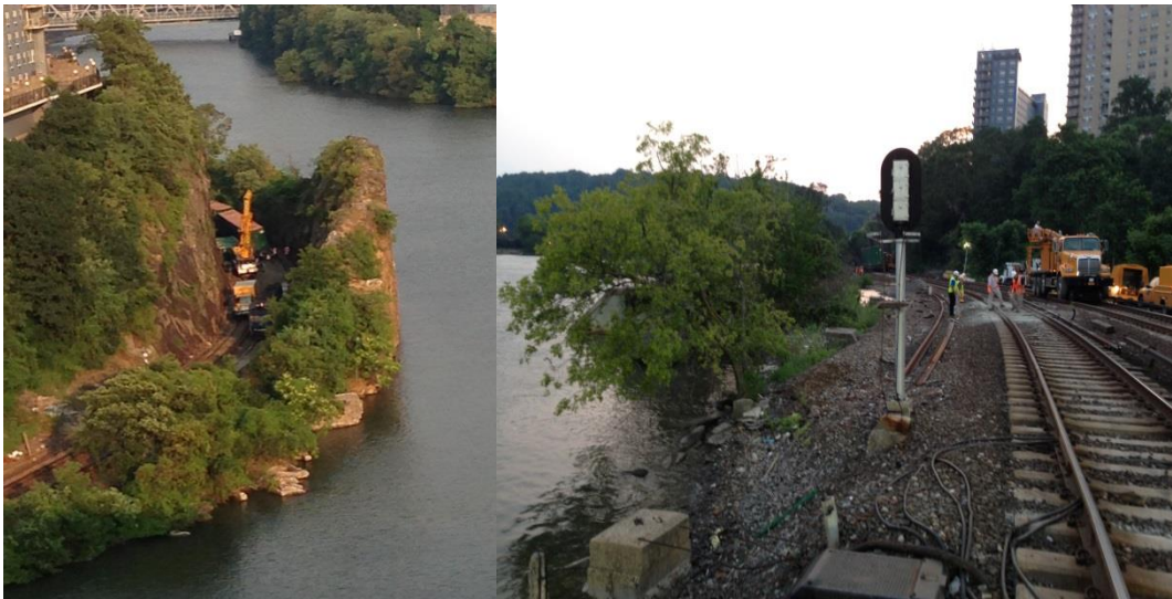
Figure 1. Derailed cars in cut (left). Point of derailment area (right).

The CSX engineer said he immediately applied the full service air brake and shortly thereafter the train went into emergency braking. He said that he immediately made an emergency radio transmission. Upon making a walking inspection, the conductor determined that the 11th through the 20th cars had derailed on main track 2 and that derailed equipment was blocking main track 1. (See figure 1.)