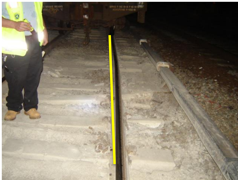
Figure 3. Point of derailment showing a slight outward bow as compared with the straight yellow line.