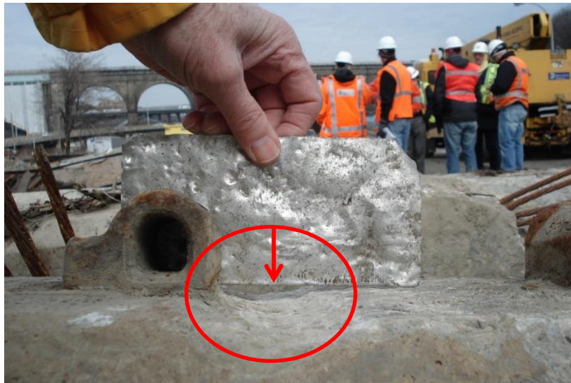
Figure 10. Groove worn into field side of rail seat.

Track panels from the derailment site were preserved and later disassembled at Metro-North High Bridge Yard. Wear in the rail seat area was noted on many of these ties along with a worn trough on the field side of the rail seat. (See figure 10.) This wear was indicative of the rail canting outward.