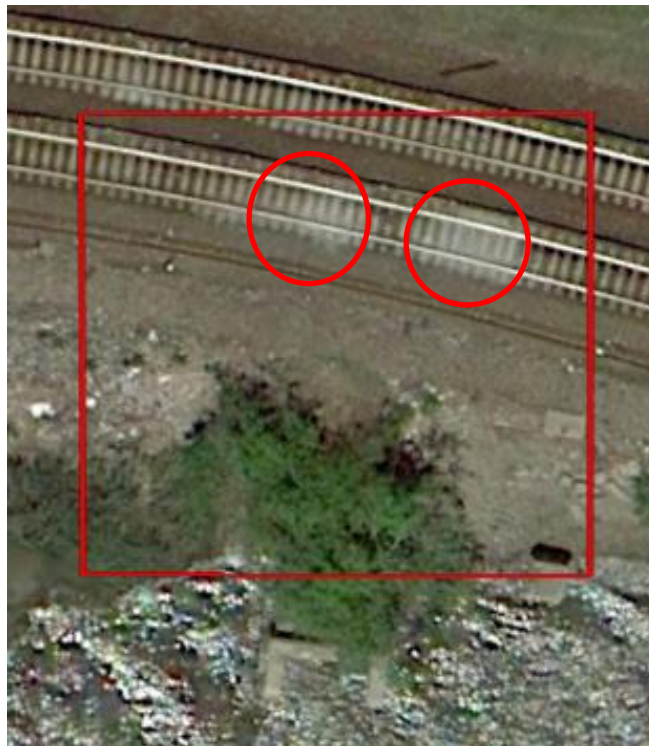
Figure 8. 2011 Satellite image showing fouled ballast at POD.