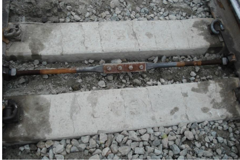
Figure 11. Cracks at centers of ties at POD. (Gage rod was installed after the derailment.)

The cross section of the ties was reduced by abrasion on the bottom of the ties, and the reduced cross section was more pronounced at the ends of ties at the inside of the curve. Steel tensioning strands were exposed on the ends of many ties. (See figure 12.) More pronounced loss of cross section at the ends of ties indicates more movement and abrasion against the ballast and is another indication of less support at the ends of ties than in the center.