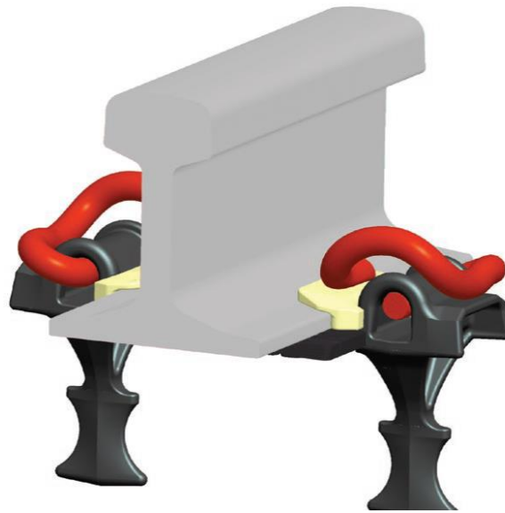
Figure 4. Diagram showing proper installation of Pandrol insulators (shown in yellow) and clips (shown in red). The rail is shown in grey.