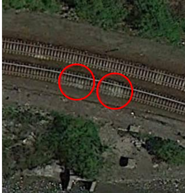
Figure 7. 2010 Satellite image showing fouled ballast at the POD (that is, the white areas inside red circles).