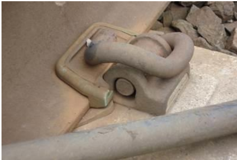
Figure 5. Proper installation of a Pandrol clip and insulator.