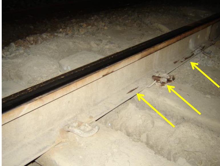
Figure 2. Marks on gage side of base of low rail at point of derailment highlighted by arrows.

The POD was determined by a wheel flange mark on the inside base of the west (low) rail at MP 9.99 (72 feet 10 1/4 inches north of CP 10). (See figures 2 and 3.)