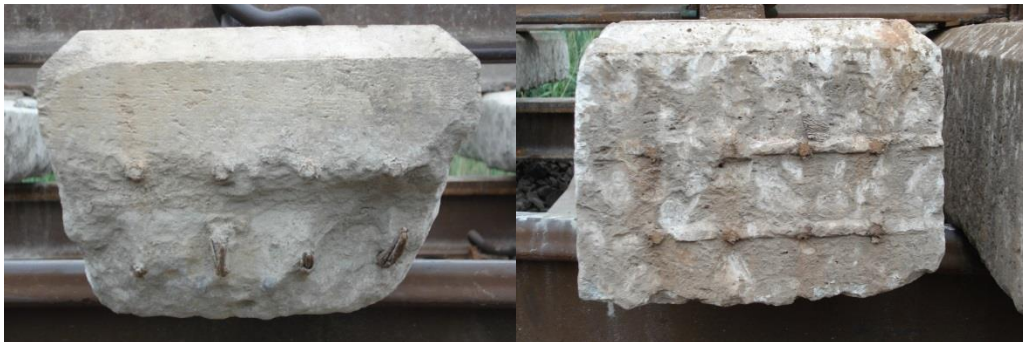
Figure 12. Tie from POD area (left) with reduced cross section and exposed tension strands and unused exemplar tie (right).

The cross section of the ties was reduced by abrasion on the bottom of the ties, and the reduced cross section was more pronounced at the ends of ties at the inside of the curve. Steel tensioning strands were exposed on the ends of many ties. (See figure 12.) More pronounced loss of cross section at the ends of ties indicates more movement and abrasion against the ballast and is another indication of less support at the ends of ties than in the center.