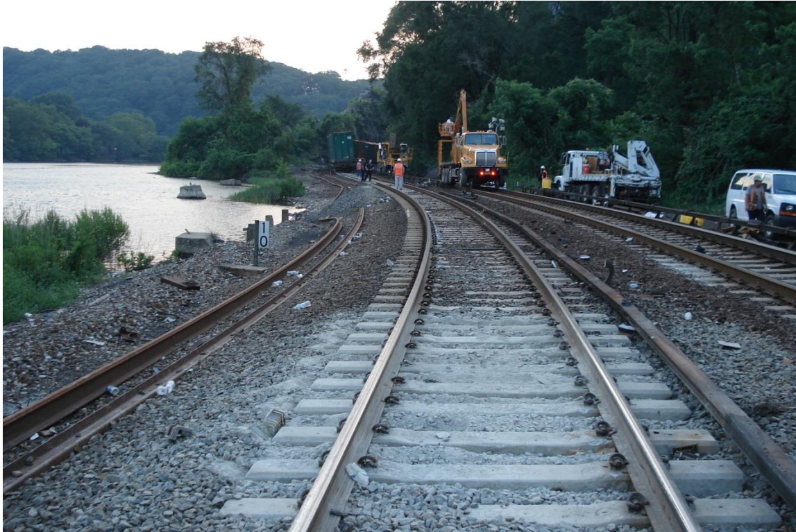
Figure 9: Close up of fouled ballast in POD area.

A similar image about 1 year later shows the POD fouled ballast more clearly. 10