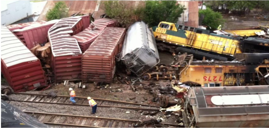
Figure 1. Train wreckage.