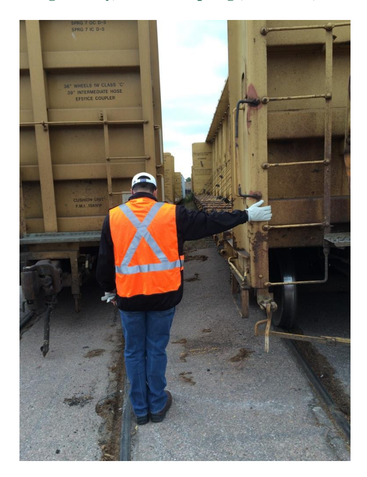
Figure 3. Checking Railroad Car Clearance.