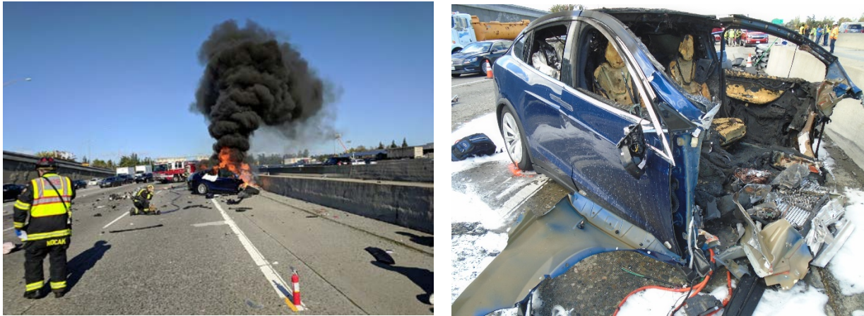
Figure 2. Northbound view of US-101 depicting Tesla postcrash fire (left) and remains of Tesla after initial fire was extinguished (right).

The Mountain View Fire Department applied approximately 200 gallons of water and foam during a period of fewer than 10 minutes to extinguish fires involving the vehicle interior and the exposed portion of the high-voltage battery. Technical experts from Tesla responded to the scene to assist in assessing high-voltage hazards and fire safety. After being allowed to cool, the vehicle was transported with a fire engine escort to an impound lot in San Mateo. The highway was reopened at 3:09 p.m.