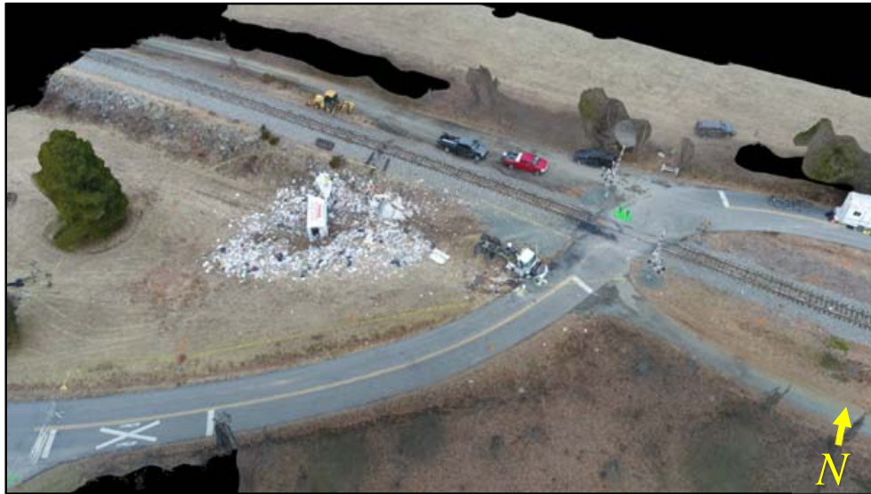
Figure 2. Aerial view of the highway-railroad grade crossing, truck chassis, body, and debris at final rest.

railroad signal bungalow next to the tracks on the southwest side of Lanetown Road (see figure 2). The refuse body separated from the truck, and the truck's two passengers were ejected. The truck came to rest off the southwest edge of Lanetown Road.