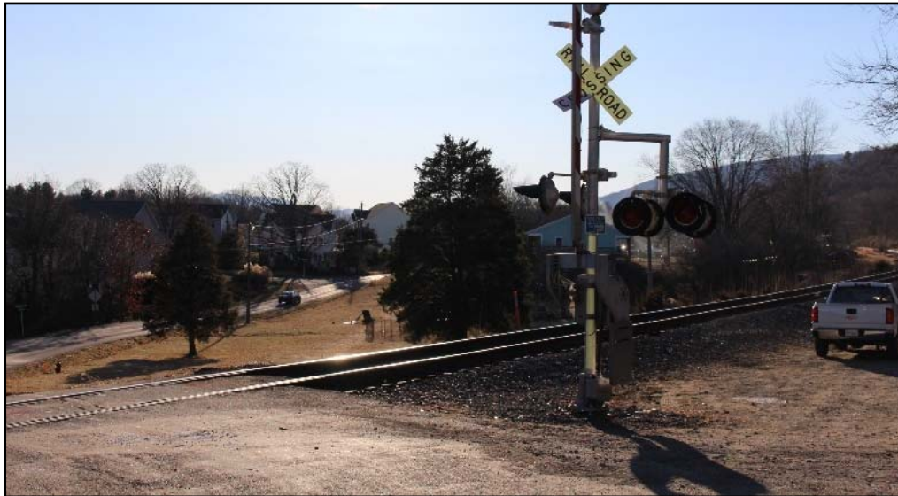
Figure 1. Southbound view of highway–rail grade crossing showing active warning devices.

On Wednesday, January 31, 2018, about 11:16 a.m., a 2018 Freightliner truck equipped with a McNeilus Truck & Manufacturing refuse body was traveling southbound on Lanetown Road in Albemarle County near Crozet, Virginia. The refuse truck, operated by Time Disposal LLC, was occupied by a 30-year-old driver and two passengers as it approached a highway–railroad grade crossing, later identified as DOT crossing 224704E. The crossing is active and includes advance warning signs and pavement markings on its approach. The crossing is also equipped with (1) crossbuck signs, (2) warning lights, (3) bells, and (4) gates (see figure 1).