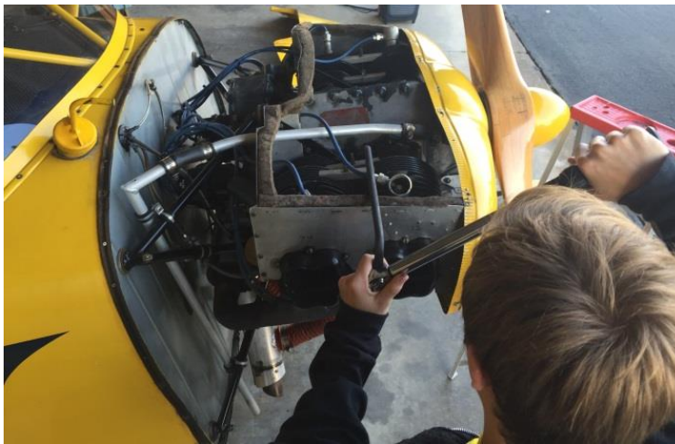
Figure 3. Mechanic applying torque to through bolts.