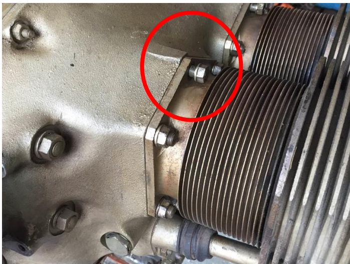
Figure 1. Cylinder with a finger-tightened nut that is not properly torqued.