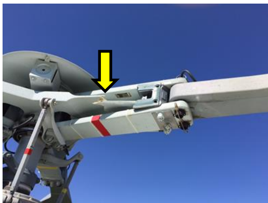
Figure 3. Main rotor system (Starflex assembly).