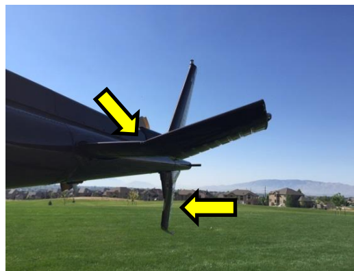
Figure 4. Empennage (horizontal stabilizer and vertical fin).