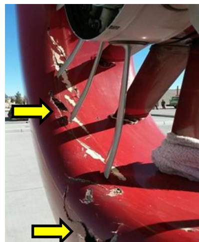
Figure 2. Lower fenestron housing.